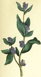
Pe-litury of the Wall