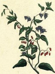
Amara Dulcis or Bitter Sweet