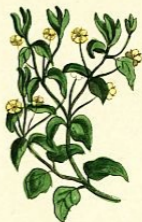
Loosestrife or Wood Willow-herb