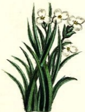
Crabs Claws or Fresh water Soldier