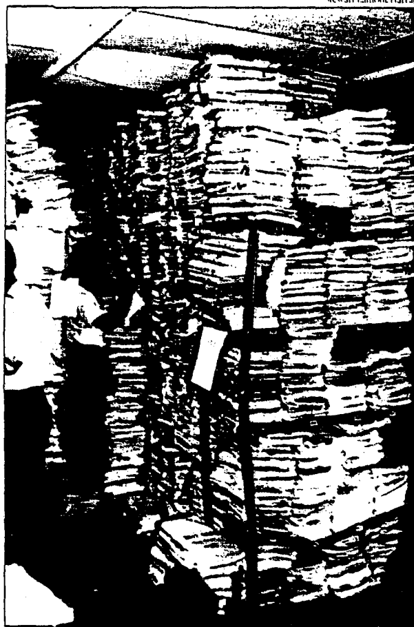
Auditing transcripts describing intimate life histories, in a Scientology storeroom in Clearwater, Fla. Something to think about a lot. should you consider being audited.