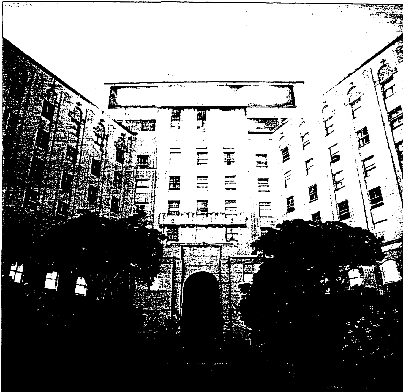
Scientology world Headquarters building in Los Angeles