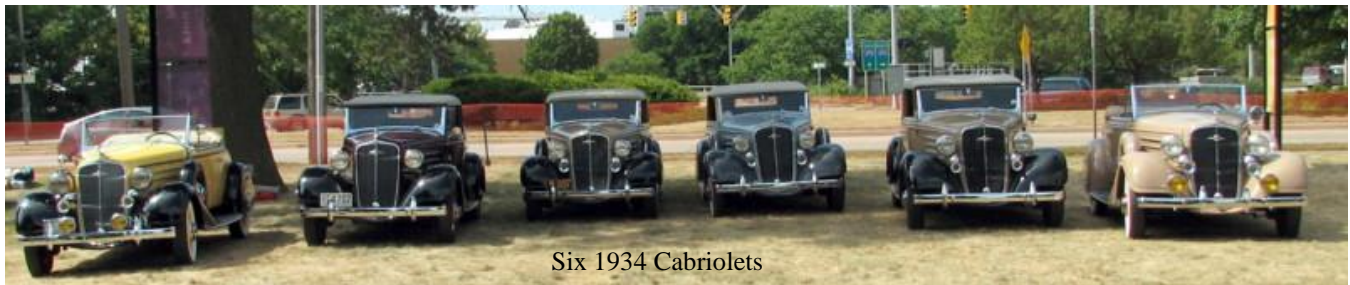
Six 1934 Cabriolets