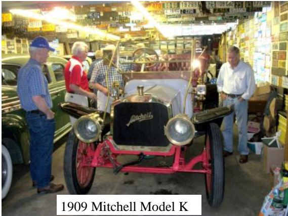
1909 Mitchell Model K