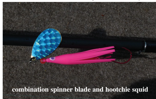
combination spinner blade and hootchie squid

fans wherever steelhead run are particularly suitable for casting in rivers. A combination spinner blade and "hootchie" squid ahead of a single hook, they are