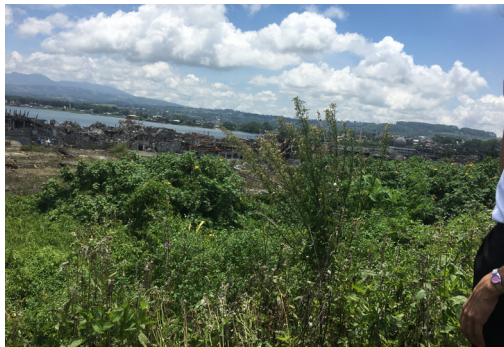
Ground Zero: 11 months after the Marawi Siege Author takes photo from Rizal Park of a once bustling part of Marawi City. Hidden from view below is the padian (marketplace).