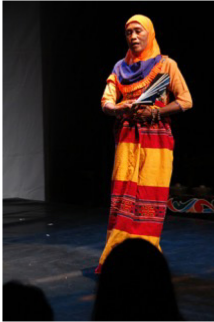
Photo of a Meranaw Onor, a chanter