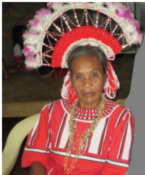
A Talaandig Chanter from Lantapan, Bukidnon