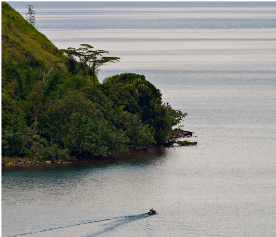
A photo of the Lanao Lake