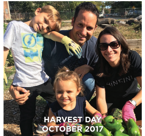
HARVEST DAY OCTOBER 2017