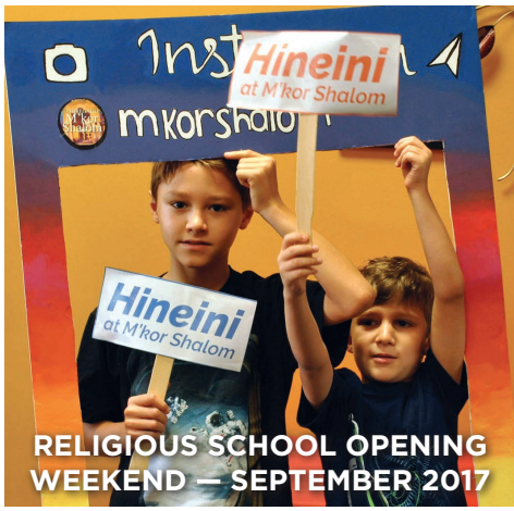
RELIGIOUS SCHOOL OPENING WEEKEND — SEPTEMBER 2017