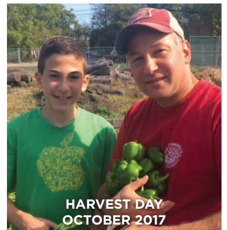
HARVEST DAY OCTOBER 2017