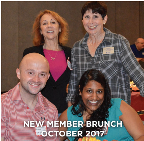
NEW MEMBER BRUNCH OCTOBER 2017