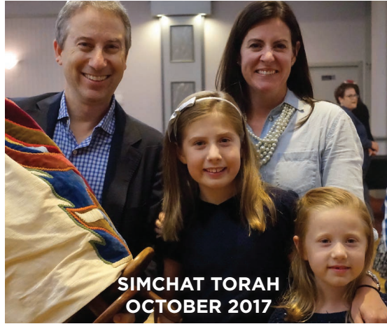
SIMCHAT TORAH OCTOBER 2017