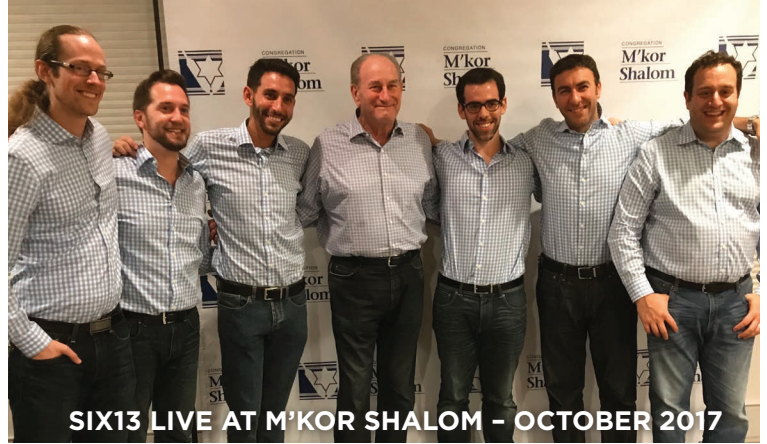
SIX13 LIVE AT M'KOR SHALOM - OCTOBER 2017