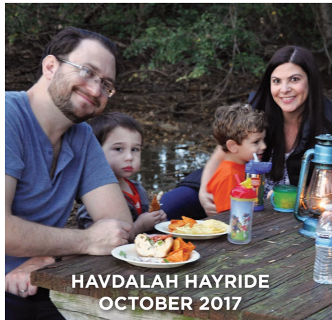
HAVDALAH HAYRIDE OCTOBER 2017