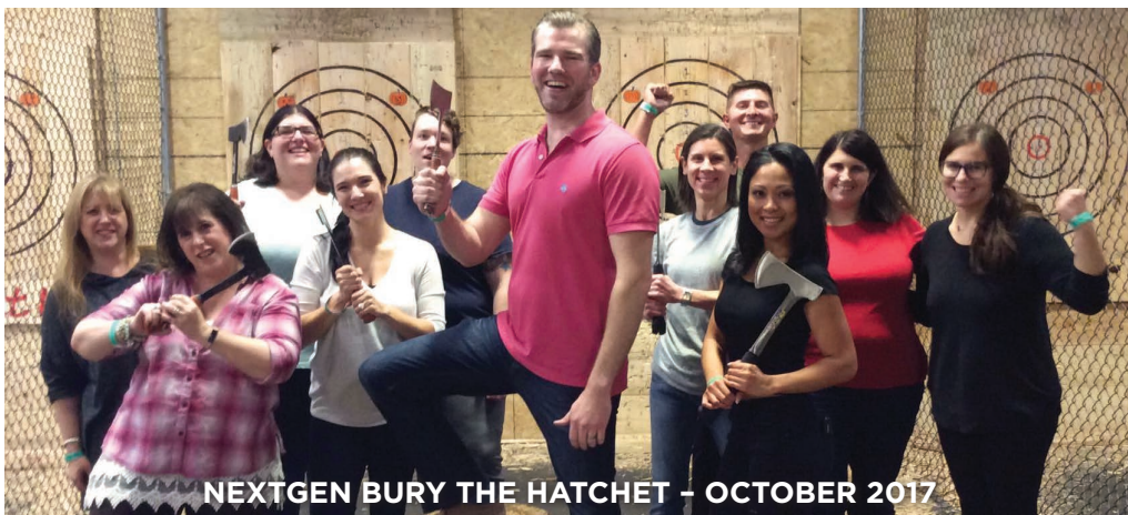
NEXTGEN BURY THE HATCHET - OCTOBER 2017