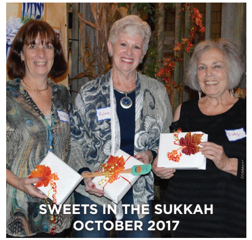
SWEETS IN THE SUKKAH OCTOBER 2017