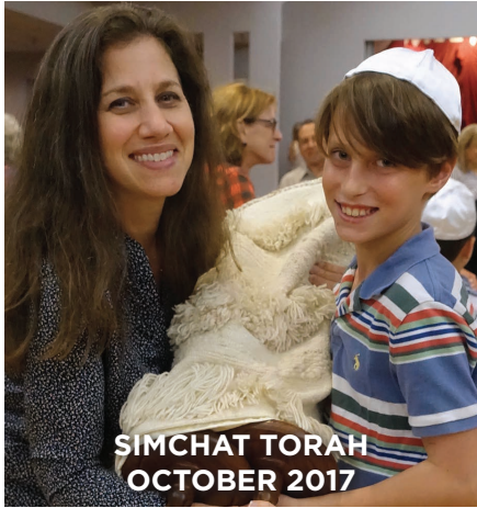
SIMCHAT TORAH OCTOBER 2017