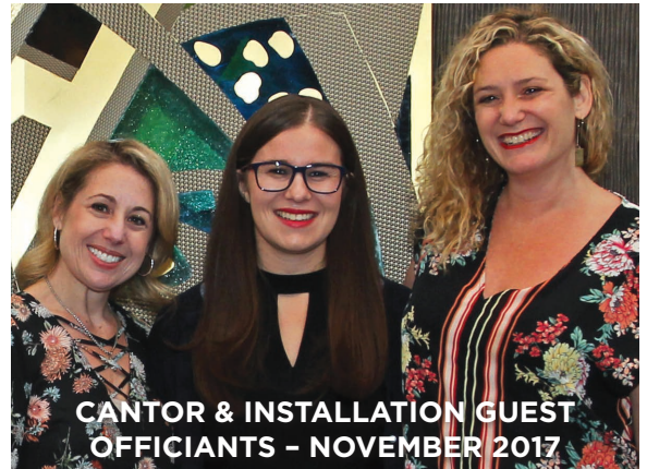
CANTOR & INSTALLATION GUEST OFFICIANTS - NOVEMBER 2017

Don't forget to follow and tag us when you use social media!