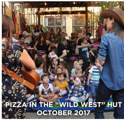
PIZZA IN THE "WILD WEST" HUT OCTOBER 2017