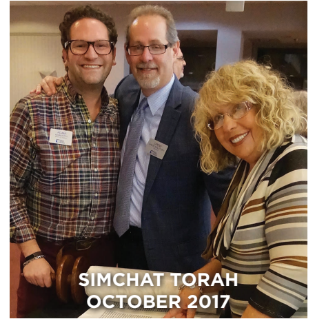
SIMCHAT TORAH OCTOBER 2017