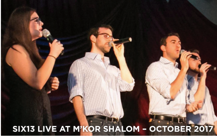
SIX13 LIVE AT M'KOR SHALOM - OCTOBER 2017

Dated Material; Please deliver by December 2.