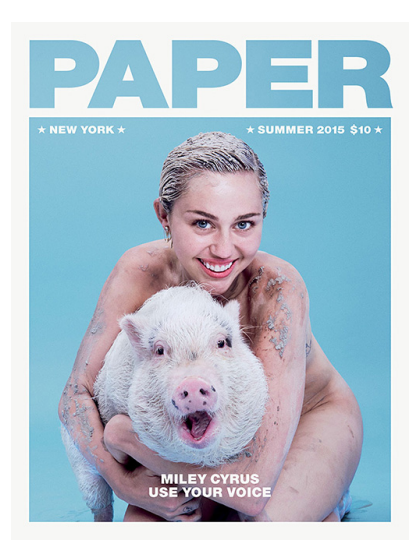
Figure 3: Cover Image of Miley Cyrus, Paper Magazine , June 2015.

In this section I discuss Swift in relation to her feminist identity and success in the music industry. Cyrus and Swift have been successful in an incredibly