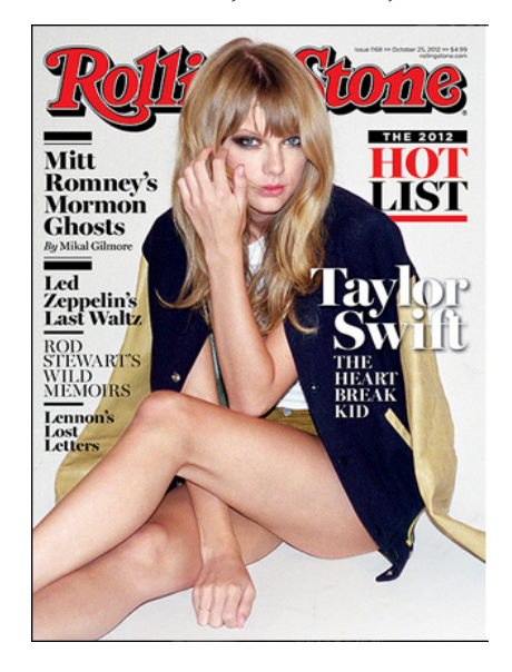
Figure 2: Cover Image of Taylor Swift, Rolling Stone October, 2012.

Eells 2013). During the aftermath of Cyrus' performance, Eells (2013) expresses Cyrus' acknowledgement of the impact her performance had and implies her difficulty in facing the volume of criticism: "it's an important time not to Google myself" (Cyrus as quoted in Eells 2013). Hence, Cyrus has acknowledged the impact that one of her performances has had upon her public image. While the female postfeminist celebrity is able to own her sexuality and be empowered by it, Cyrus' actions had powerful consequences for her reputation and image in the media. Cyrus