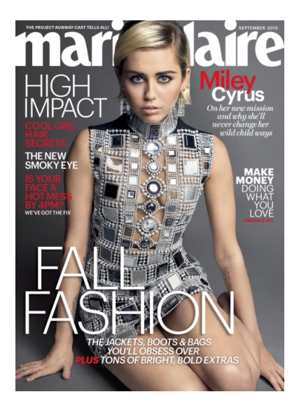
Figure 4: Cover Image of Miley Cyrus, Marie Claire , August 2015.