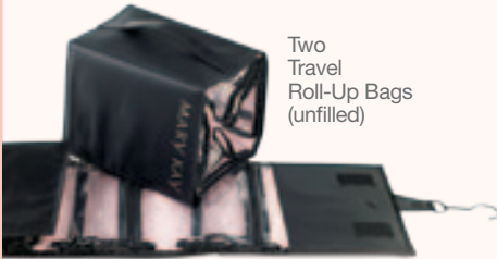
Two Travel Roll-Up Bags (unfilled)

Plus, earn a BizBuilder Bucks $50 wholesale product credit.**