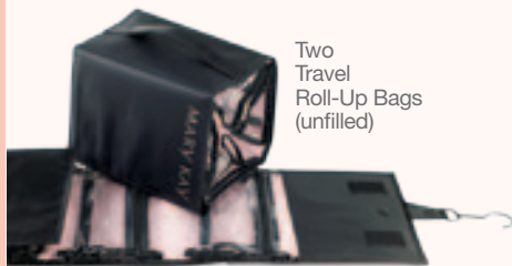
Two Travel Roll-Up Bags (unfilled)

Plus, earn a BizBuilder Bucks $125 wholesale product credit.**