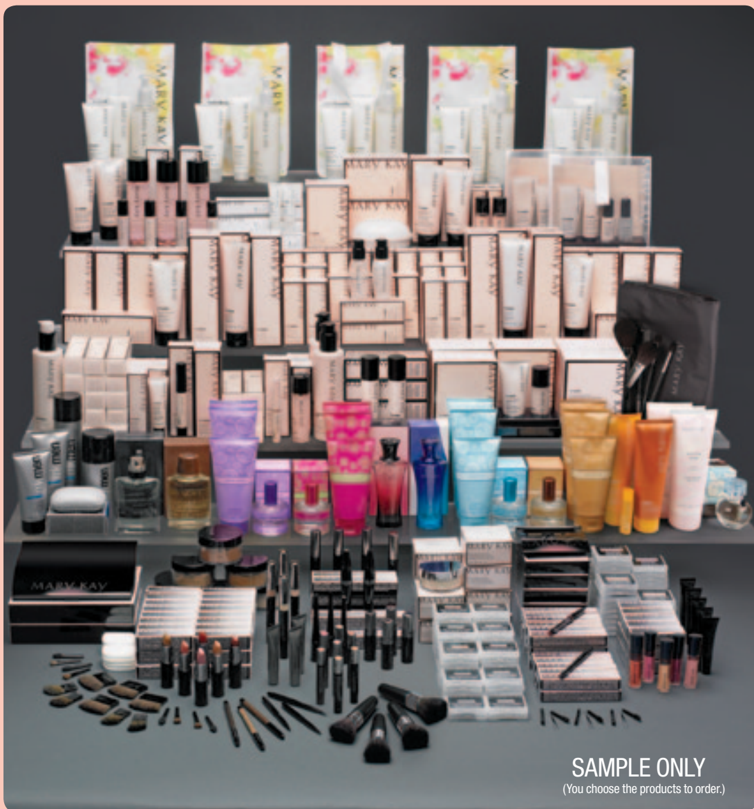
SAMPLE ONLY (You choose the products to order.)

Get your business off to a powerful start with $3,000 wholesale inventory. It gives you: