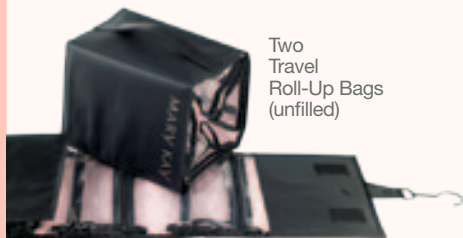
Two Travel Roll-Up Bags (unfilled)

Plus, earn a BizBuilder Bucks $100 wholesale product credit.**