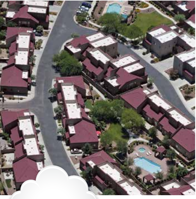
mv0<sup>®</sup> Business SMART ACCESS CONTROL