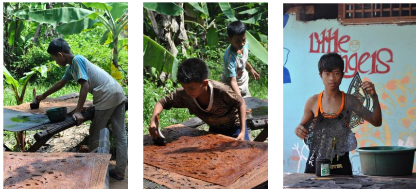
Shellacking and painting