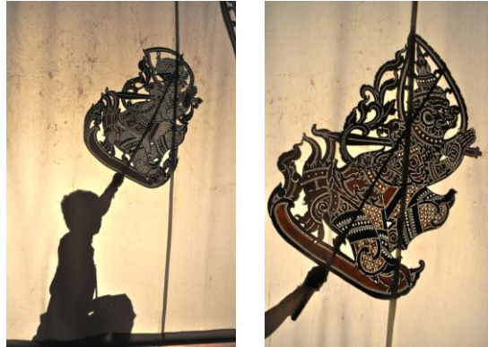
Sbaek Thom puppets in shadow at Sovanna Phum

performance at the time of the field research was "New Contemporary Dance and Mixed shadow Puppets Theater ( Sbaek Thom ), Mask Theatre" (the Khmer version of the Ramayana), a dance by the masked dance troupe in combination with a Sbaek Thom performance.