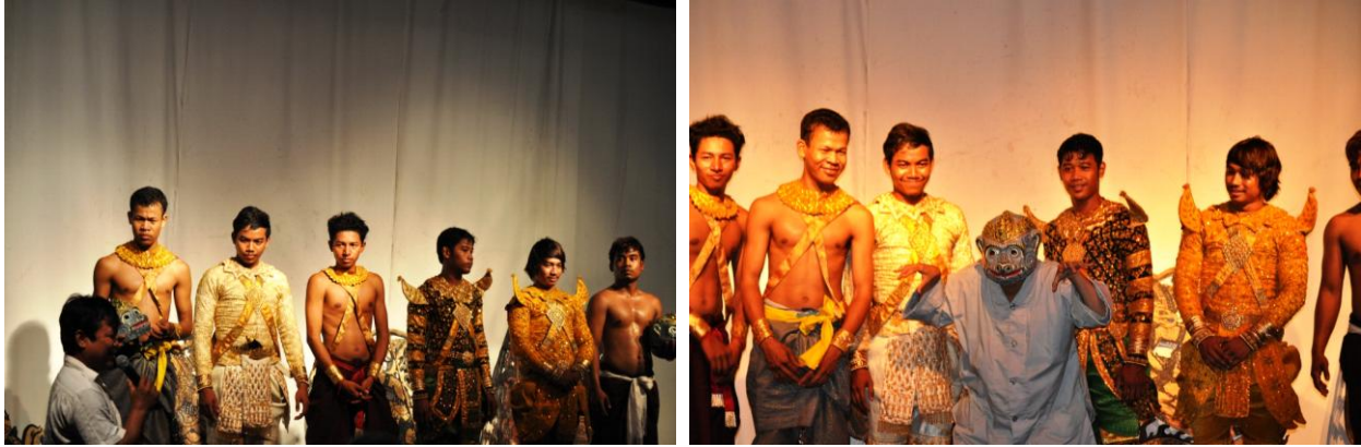
Mask dancers at Sovanna Phum - characters from The Reamker (Khmer version of Ramayana )