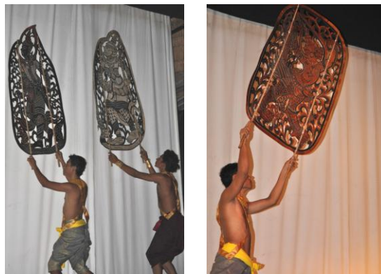
Sbaek Thom performance at Sovanna Phum