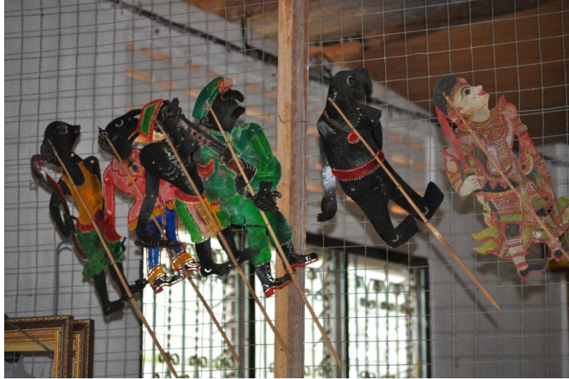
Traditional Nang Talung clown puppets

The Village continues to craft popular Nang Talung puppets for performing troupes. However, they also produce life sized Nang Yai puppets that depict whole scenes from The Ramakien . They are so large that a puppeteer can handle only one piece, and each piece is held aloft by dancers behind and in front of the screen for performances. These pieces are frequently sold by the Village as decorative art, which represents a diversification of function of the leather shadow puppets, and creating decorative art for sale has become a main focus of the Village. While some are traditional Nang Yai scenes from The Ramakien , others are of objects and images that resonate with Thai and other visitors. They include images of the Thai King and Queen, meditating monks, and, particularly, elephants that are viewed as symbols of kindness and wisdom in Buddhism and Hinduism. Furthermore, the Village also produces small leather objects like key chains as souvenirs.