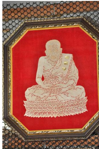
Sitting monk (in progress, left; completed right)