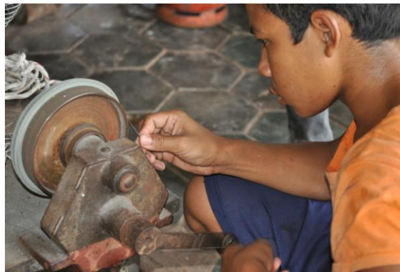
Little Angels students make and prepare their tools from scrap metal