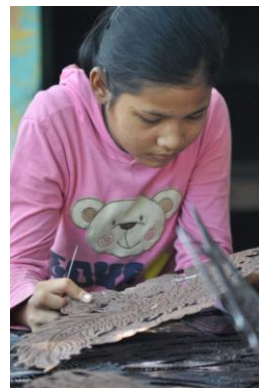
Crafting puppets at Little Angels Orphanage