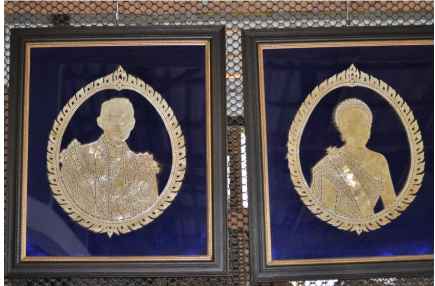
Preparing work for display and sale (left) King and Queen of Thailand (Right)