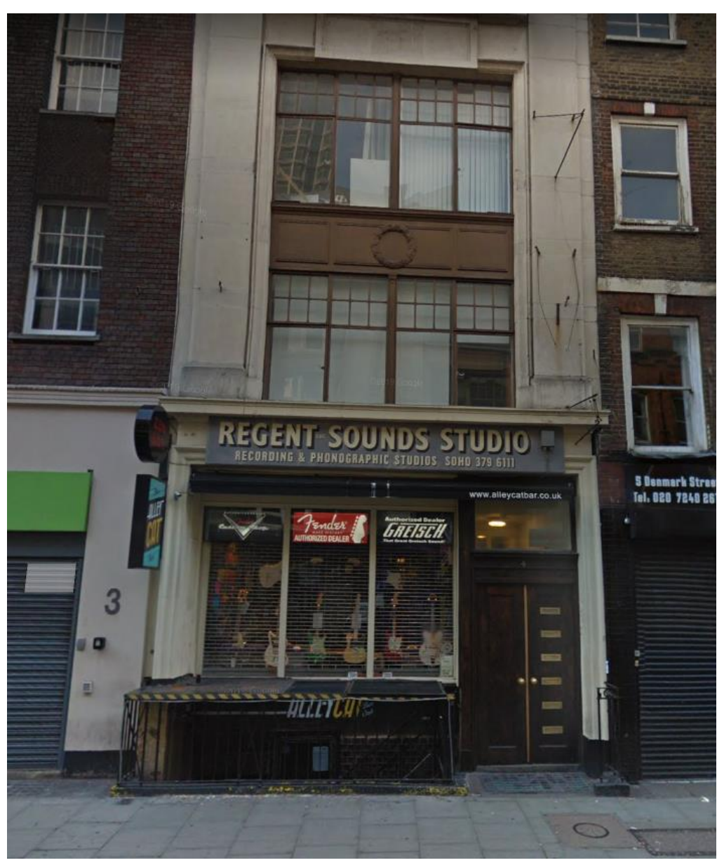
Regent Sounds Studio circa 2019

Decca Records balked at Oldham's suggestion of no title or group name on the album but Oldham held the tapes. Decca balked in the press, so did Oldham who still held the tapes.