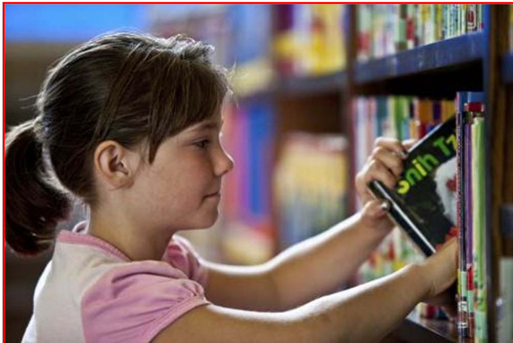
A young girl at Monarch Elementary School in Union, South Carolina, selects a book to read during Save the Children's afterschool literacy program.