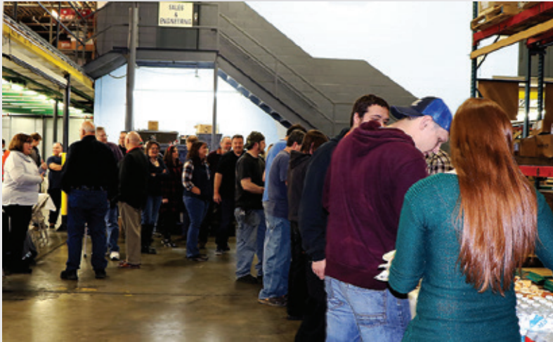
Employees were treated to a delicious catered lunch.