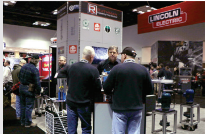
Gusher's Gary and Scott talk pump solutions with show visitors.