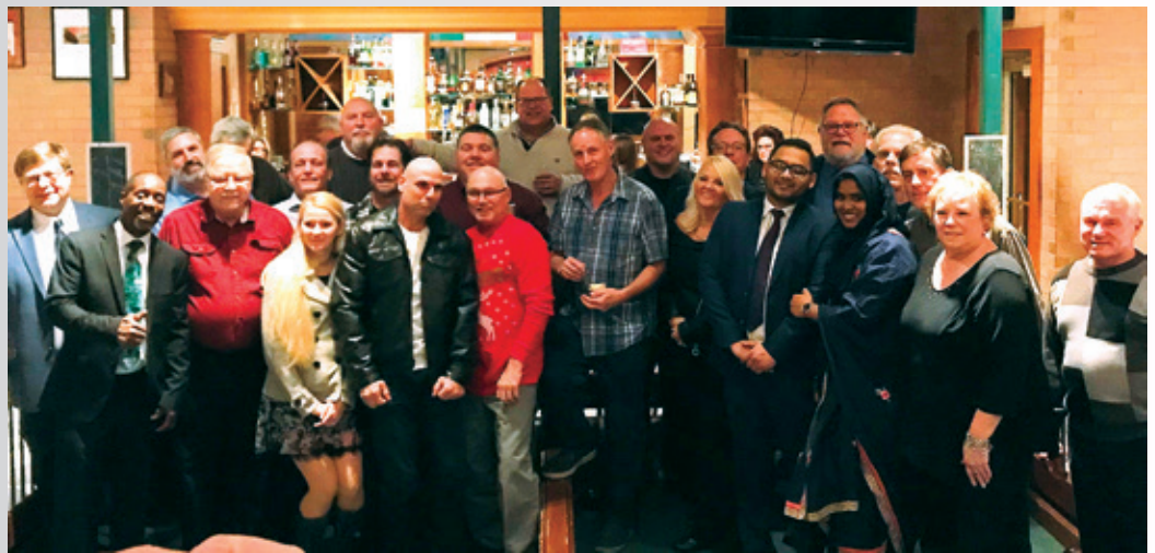
All three companies get together for a group photo.