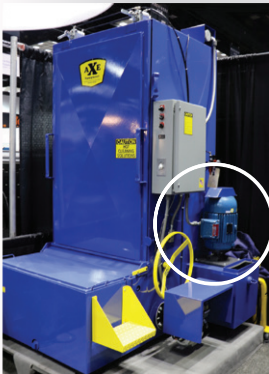
The motor of a Gusher 7800 series pump is visible on this Axe Equipment Spraywasher. Axe is a longtime user of Gusher Pumps, and one of many OEM customers exhibiting at PRI.