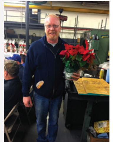
The poinsettias decorating the tables were raffled off, with one going to 'Joe the Tester'.