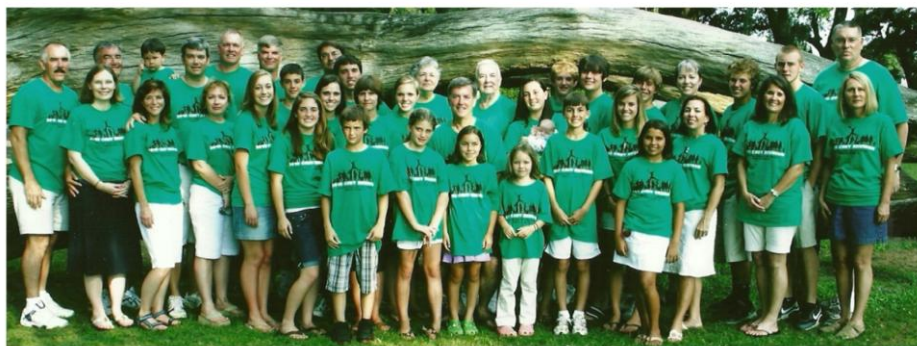
The Cody Family Reunion 2010