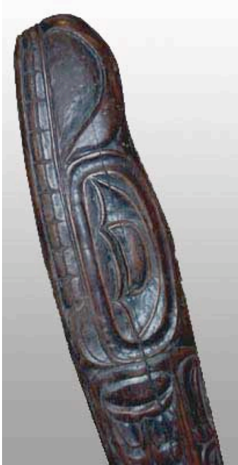
2 Club used for killing fish

reversal in the process of understanding. To understand a real object in its totality we always tend to work from its parts. The resistance it offers us is overcome by dividing it. Reduction in scale reverses this situation. Being smaller, the object as a whole seems less formidable. By being quantitatively diminished, it seems to us qualitatively simplified. More exactly, this quantitative transposition extends and diversifies our power over a homologue of the thing, and by means of it the latter can be grasped, assessed and apprehended at a glance.