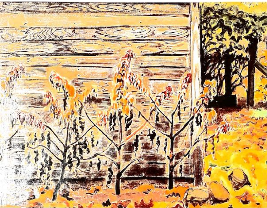
Autumn Embers (Frosted Scarlet Sage) (1944), Charles Burchfield.