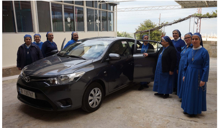
The Sisters with their new Toyota Yaris that will help them minister to thousands of people in Lebanese villages.

The vehicle is needed to transport the Sisters to neighboring villages in Lebanon to serve children, the poor,