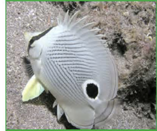
FOUR-EYE BUTTERFLY FISH PEZ MARIPOSA CUATRO OJOS