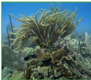
SOFT CORAL CORAL BLANDO