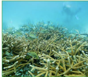
STAGHORN CORAL CORAL CUERNO DE CIERVO