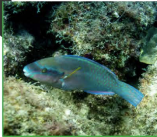
PARROT FISH PEZ LORO