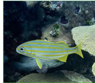
FRENCH GRUNT FISH PEZ RONCADOR