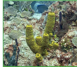
YELLOW TUBE SPONGE ESPONJA TUBULAR AMARILLA