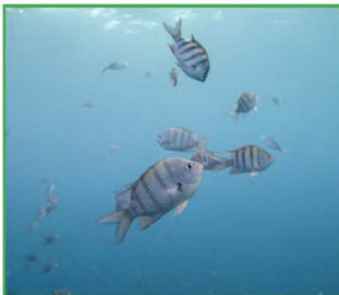
SERGEANT MAJOR FISH PEZ SARGENTO MAYOR