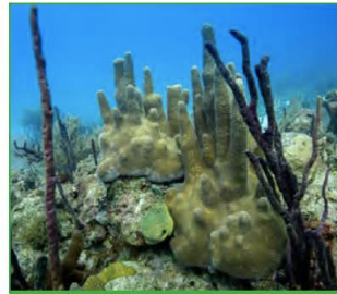
PILLAR CORAL CORAL PILAR