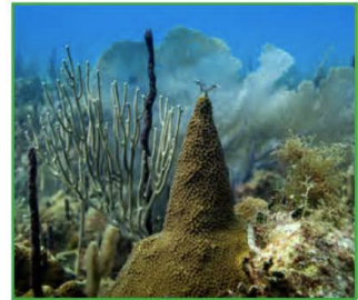
MONTASTREA CORAL CORAL MONTASTREA