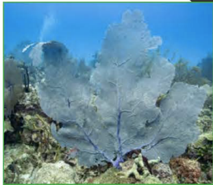
FAN CORAL CORAL ABANICO

El objetivo de este es simple—encuentra los tantos animales y plantas de la siguiente lista durante el viaje virtual y marca las casillas cuando logres verlos. Las fotos son para inspiración; los objetos pueden verse ligeramente diferentes durante el evento. ¡Buena suerte!