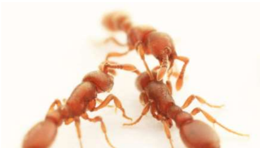
Clonal raider ants

The very thing that makes social insects so fascinating—their sociality—also makes them tricky to use in the lab. A functional colony requires thousands of workers. They also need a queen to anchor the colony and replenish the workers. It’s a combination that makes colony maintenance both expensive and labor-intensive, and the colonies often need frequent reinforcements brought in from wild populations.