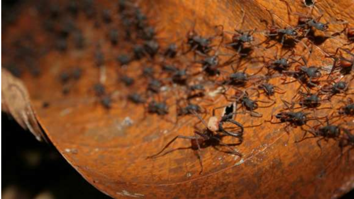
A raiding column of Eciton burchellii army ants return to the bivouac in Brazil.

Kronauer's childhood ant-collecting skills would come in handy when he first started collecting clonal raider ants from Okinawa and the U.S. Virgin Islands. "I spent eight to ten hours a day just flipping rocks or logs," he says. Often, the reward for a whole day's toil was just a single colony. But the advantage of O. biroi was that Kronauer only needed ten or so workers to start a new colony. "That's the cool thing about these guys. They're not so easy to find and collect, but once you have them in the lab, they're super easy to maintain," he says.