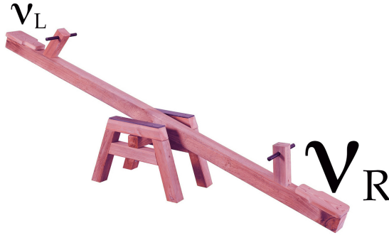
Figure 2: The seesaw mechanism would explain the tiny mass of the left-handed neutrino by the existence of a heavy specie with opposite chirality.

a heavy Majorana neutrino with mass M_R . According to (16) N is essentially a superposition of a Dirac R neutrino and Dirac L antineutrino which couple to the very massive W_R boson.