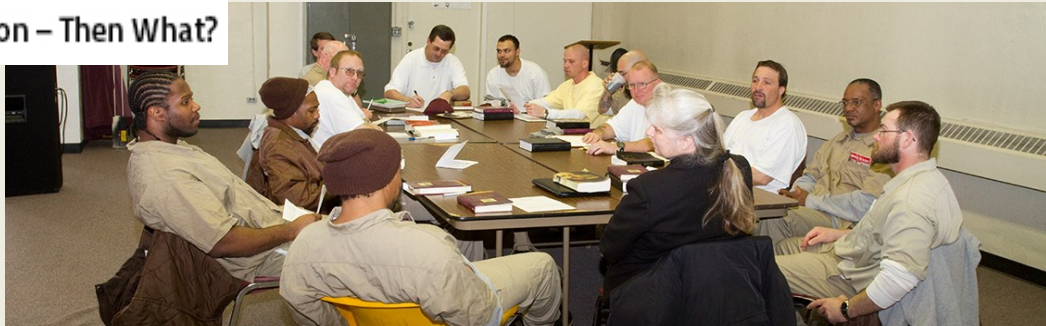
Released and Restored is Advance Special #713 of the Great Plains UMC Annual Conference