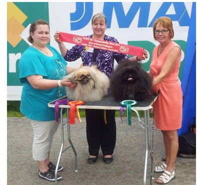
Smooth Coat Chihuahua winners SAWO 2014 Long Coat Chihuahua winners SAWO 2014 Pekingese winners SAWO 2014