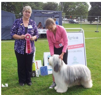
Best in Group 1 - First