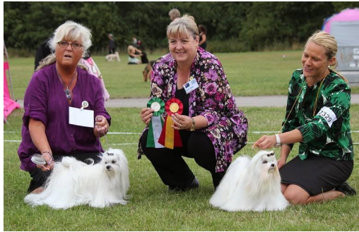
It was a very windy and wet day and I was amazed we actually got a picture.