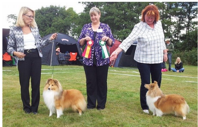
BOB & BOS Shelties