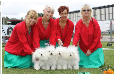
My BOB and BOS Maltese winners below. BOB dog and CACIB was from Intermediate class, Swd Junior Ch. Black Boots Richelieu Pecan Pie and BOS was from Champion class, Nord Ch. Purple Angel Chansengla.