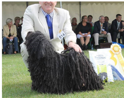
Best in Group 1 - Third

Best in Group 1 - Fourth was a Bouvier Des Flanders (I don't have a quality photo).