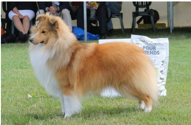
BOB, Best in Group 1 - Second

My BOB and BOS Shelties were of excellent type and two I could easily have squeezed in my suitcase. BOB was Fin, Nor, Swd, Ch. Windcrest Stylish Move and my BOS was from the same kennel and was the grand dam of the BOB winner, Mulit Ch. Windcrest Smart Move. I gave my BOB Sheltie 2 nd in Group 1 Pastoral behind a very well turned out Bearded Collie.