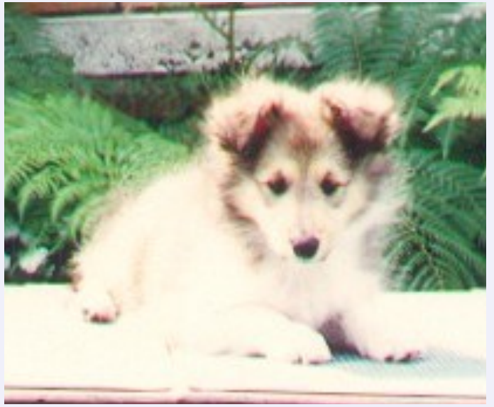
At 9 weeks

He had some funny ways about him. We always knew when it was going to rain. He would stand out in the yard and bark at the sky. Sure enough, within 10 minutes it would rain. We could go to shows and could be gone for days interstate but he always knew when he was nearly home. He would stand up and twirl and bark. No matter which way we went or returned, he always sensed where home was.