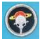
Citizenship in the Universe

Explain how you earned these spoof merit badges to your mom!