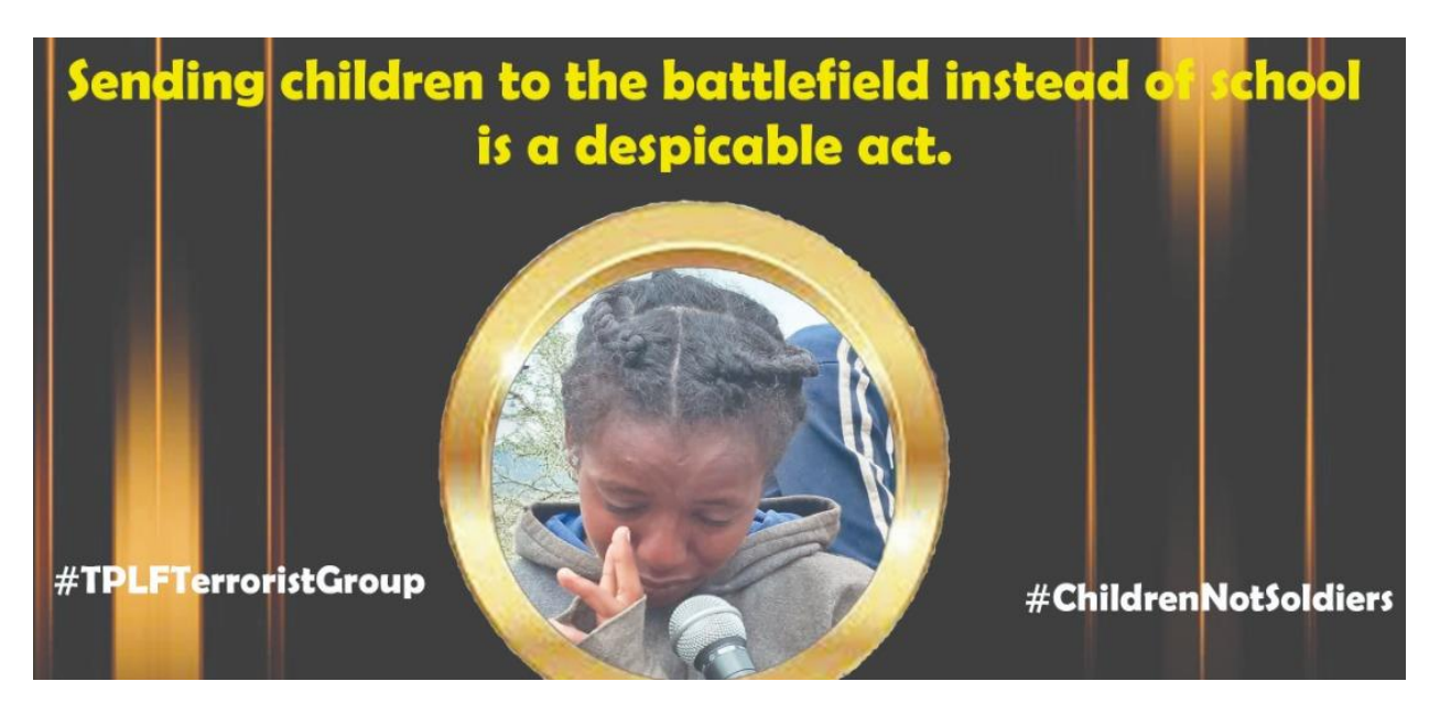
A Tigrayan child soldier captured at Afar Front

Armed groups that are distinct from the armed forces of a State should not, under any circumstances, recruit or use in hostilities persons under the age of 18 years. States Parties shall take all feasible measures to prevent such recruitment and use, including the adoption of legal measures necessary to prohibit and criminalize such practices.