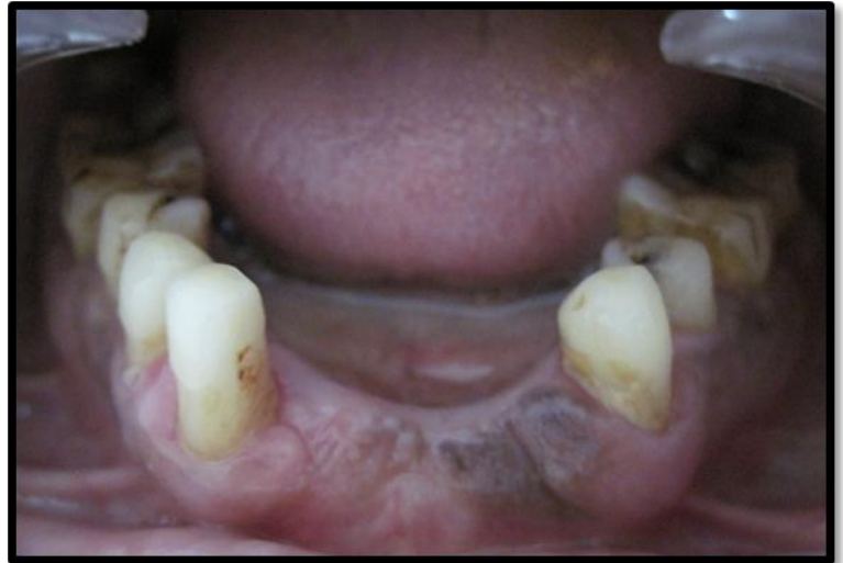
Fig. 2. Lower Natural Teeth