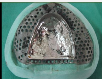
Fig.8. Metal Base