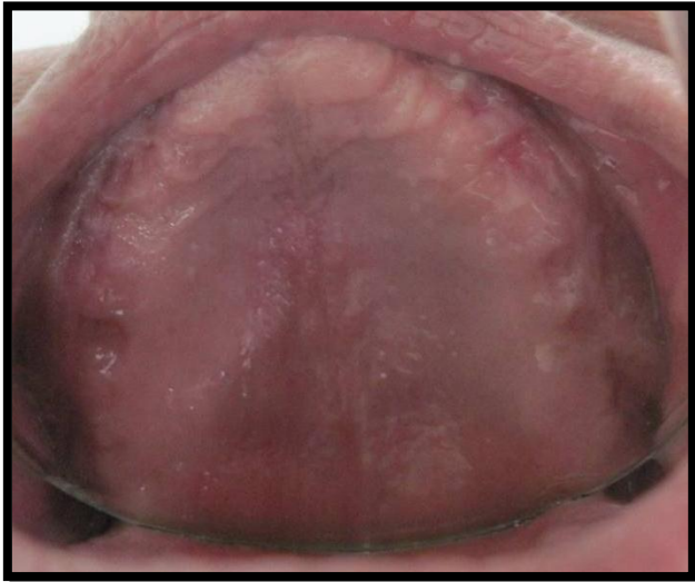
Fig. 1. Edentulous Maxilla