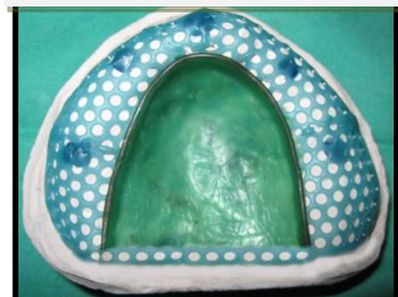
Fig.7. Wax Pattern