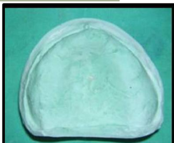
Fig.6. Master Cast