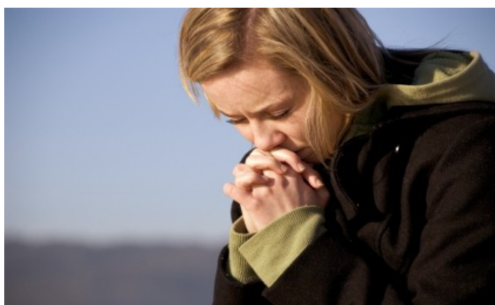
Illustration 4: Sleep paralysis often comes at difficult crossroads in life

our most stressed out, as we take on new roles and responsibilities, or are suddenly forced to face existential realities such as a death in the family, or a debilitating sickness of our own.