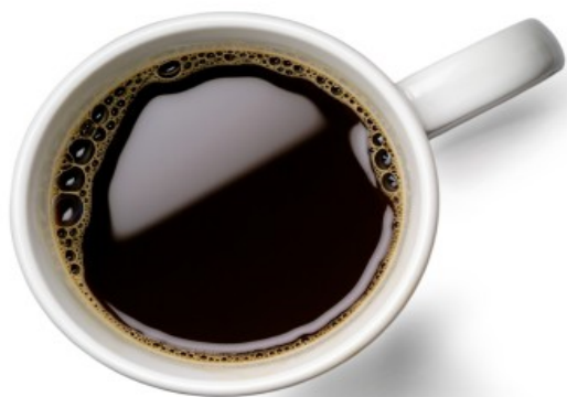
Illustration 5: Too many stimulants can mix up healthy sleep patterns and bring on SP

schedule is hard on our bodies. So, as much as possible, go to bed and wake up at the same times.