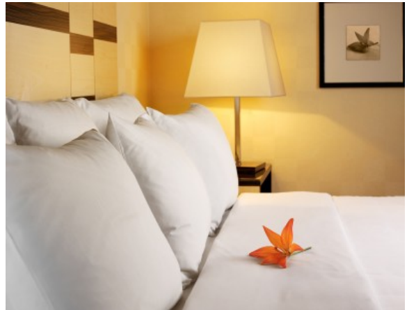
Illustration 6: Creating a sanctuary out of your bedroom is key to feeling safe

Some more ways to cope include adding bedtime rituals that create a “safe place” for sleeping, such as gentle music or aromatherapy an hour before sleep. Also, make a connection to your deep beliefs about the world: where can you “lean against” to help calm you down during fearful encounters? Having a sense of gratitude and the courage to love can break through the spell of fear in SP. For others, repeating the scientific truth that “this is normal, I am experiencing REM paralysis” is an effective way to keep fears from spiraling out of control.