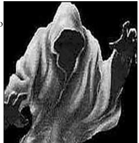
Illustration 3: For many, not being able to see the Strangers face is the most terrifying aspect of the vision

This is where SP and hypnagogic hallucinations merge into a lucid nightmare, leaving sleepers dazed, horrified and scared to go back to sleep for hours afterwards. In Medieval times the Incubus was the demon known to sit on women's chests to molest them. In Hawaiian society, the spirits are known as the Night Walkers . In Teutonic lore, the Doppelganger . And we can't overlook the fact that many alien abduction tales start with being paralyzed in bed.