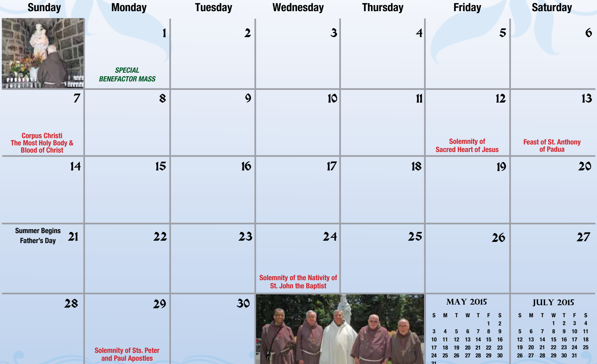
Photo: The St. Anthony Shrine at Graymoor has been a special place of Pilgrimage for more than 50 years.