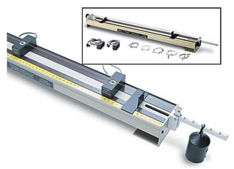
The Pasco sonometer showing weights sound sensor and driver.

One purpose of this lab is to look at relationships between density, tension and frequency in vibrating strings. We will try to use this relationship to understand some of the decisions made when choosing strings for different instruments. We also will explore how the string vibrates more easily at certain frequencies that we called modes. The spectrum of a plucked string will be related to its modes of vibrations. After a string is plucked different frequencies excited decay at different rates. We can explore how the timbre of the note changes as the vibrations die away.