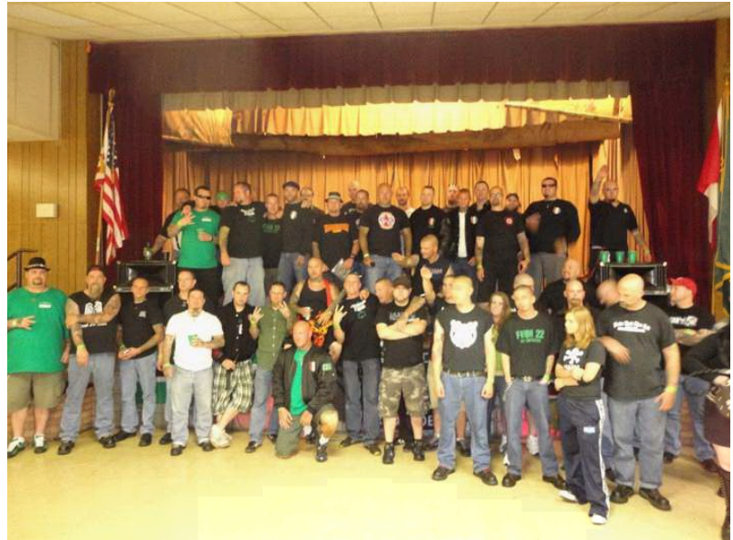
Attendees at Plunder and Pillage 2011

Today, white power music is well established in the United States, where it has existed for three decades. Hate music arose originally in Great Britain in the 1970s as the skinhead subculture that originated there diverged into two different streams: a traditional skinhead stream and a racist skinhead stream. As racist skinheads emerged, they created a white supremacist variation of the skinhead-related music genre called Oi! (sometimes also known by the deliberate euphemism “Rock against Communism” or RAC). In the late 1970s, and more so in the early 1980s, both the racist skinhead subculture and its music crossed the Atlantic to the United States and Canada.