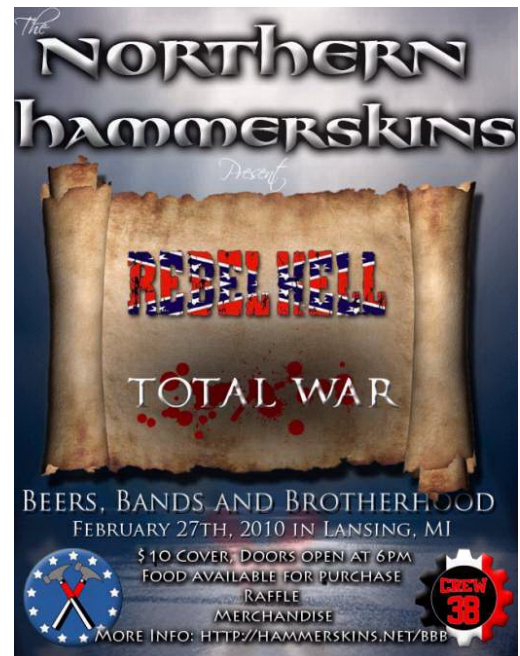
Northern Hammerskins concert, 2010