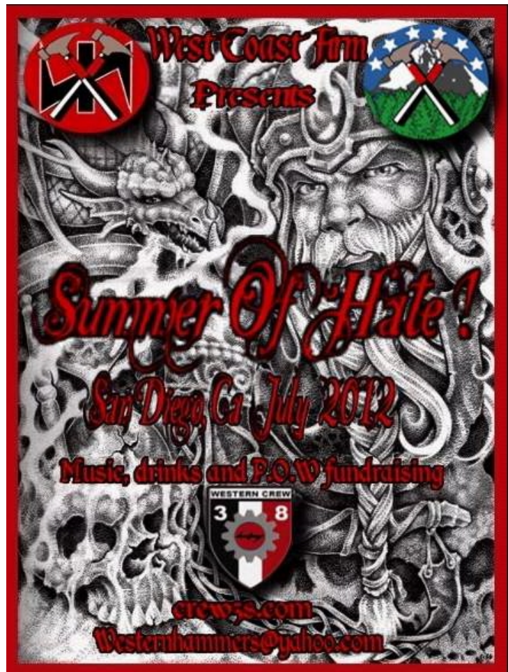
Summer of Hate Flyer

Because the white power music scene is small and somewhat “incestuous,” there is considerable overlap between bands. Many white power musicians may be members of more than one band, or may sometimes play with another band. Sometimes this is because musicians from different bands may want to play together without leaving their original bands, so they form a new one. In other cases, it may be because they want to play a different style of music, so they play one style of music in one band, and another style in a second band. In places with a concentration of white power musicians, such as Orange County, California, this sort of shuffling may go on extensively. When Wade Page was in North Carolina, he was simultaneously involved with three bands in recent years—Definite Hate, End Apathy, and 13 Knots—that all had more or less the same band membership.