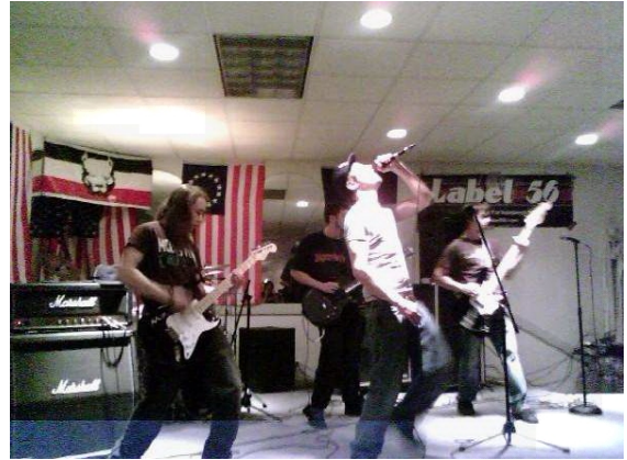
Band playing at Uprise, 2009

Today is the first day of a brand new fight With everything that's happened up until now building up in my mind No more holding back you're going to listen to what I say The new voice of a once great race and we're not going away All this time we've waited for our day to come Been knocked down but we got up and now we're twice as strong The things we've loved and the pain we've felt can't be expressed in a song