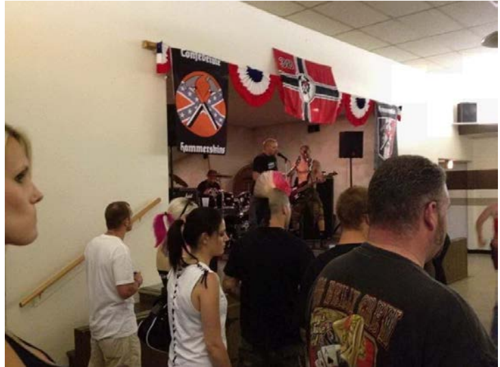
Summer of Hate, San Diego, 2012

This growth leveled off by the mid-2000s. By 2004, Panzerfaust Records had collapsed, following the arrest of one of its proprietors and a related scandal. Resistance Records still existed, but it was well on its way to decline following the death in 2002 of National Alliance leader William Pierce, which caused that group to fall apart. Other, previously smaller distributors replaced much of this business, but the white power music scene has been stable now in the United States for some years.