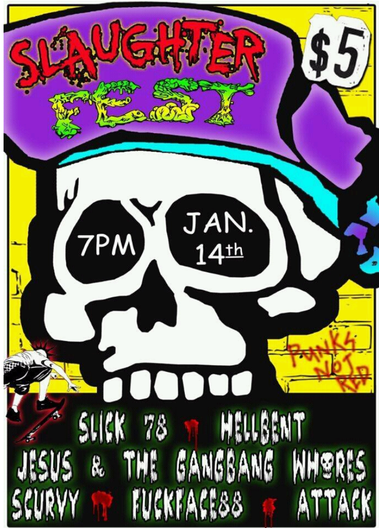
Flyer for Slaughterfest, 2012

Though a specific group may organize a white power music concert, the actual concerts are typically open to all interested white supremacists. In fact, such events are one of the ways white supremacists from different racist skinhead groups can meet and associate with each other. Members of groups like the Hammerskins, Volksfront, the Vinlanders Social Club, Supreme White Alliance or others might well come together for a concert and socialize (or occasionally fight).