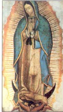
Pray for Unborn Human Life

To order either of these prayer cards free of charge (donations suggested), send your request to: