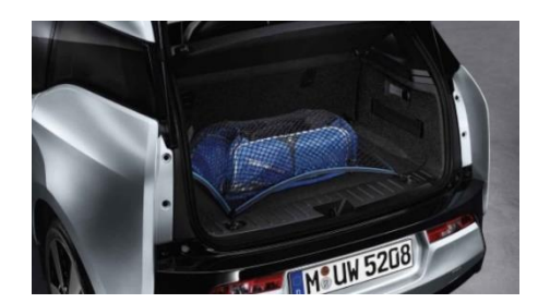
BMW Transport net