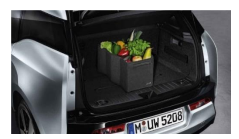
BMW foldable luggage compartment mat