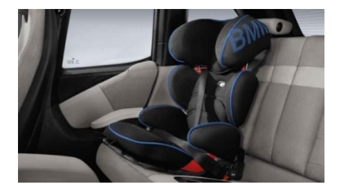
BMW Junior Seat

For more information, please contact your preferred BMW Dealer who will be pleased to advise you on the full range of Genuine BMW Accessories, or visit bmw.co.nz/accessories .