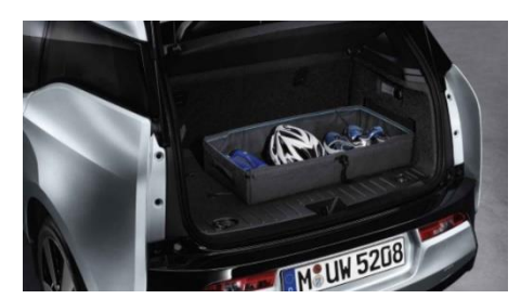
BMW Folding Box