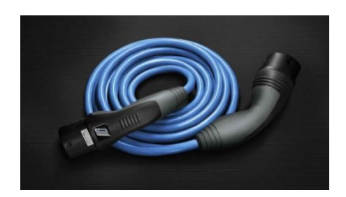
BMW Public Charge Cable