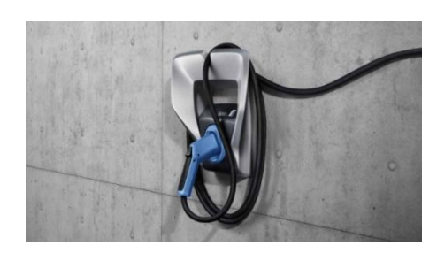
BMW Wall Charger