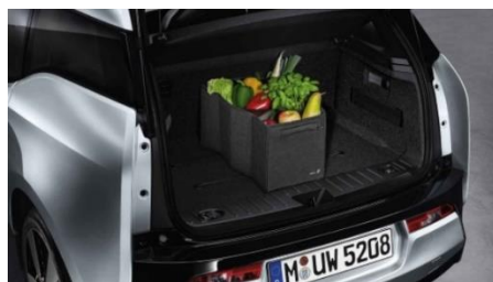
BMW foldable luggage compartment mat