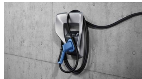
BMW Wall Charger