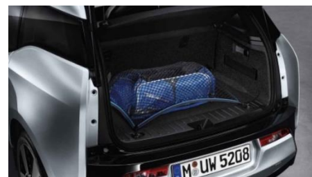
BMW Transport net