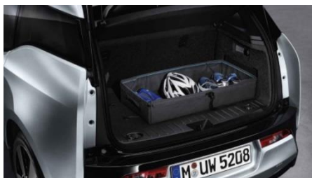
BMW Folding Box