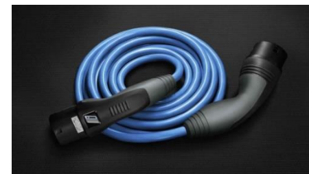
BMW Public Charge Cable