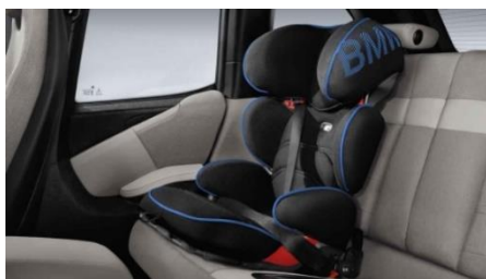
BMW Junior Seat

For more information, please contact your preferred BMW Dealer who will be pleased to advise you on the full range of Genuine BMW Accessories, or visit bmw.co.nz/accessories .