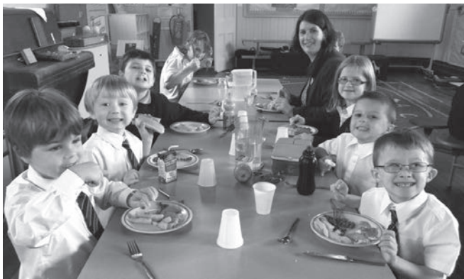
Primary One children enjoying their lunch

Email address for the local policing team is: maybolenorthcarrickandcoyltoncommunitypolicingteam@scotland.pnn.police.uk