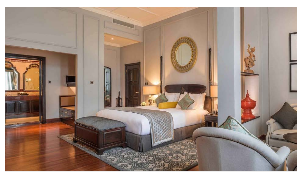
The Strand Hotel Yangon: Its Past Present and Future – The New Look of Deluxe Suite