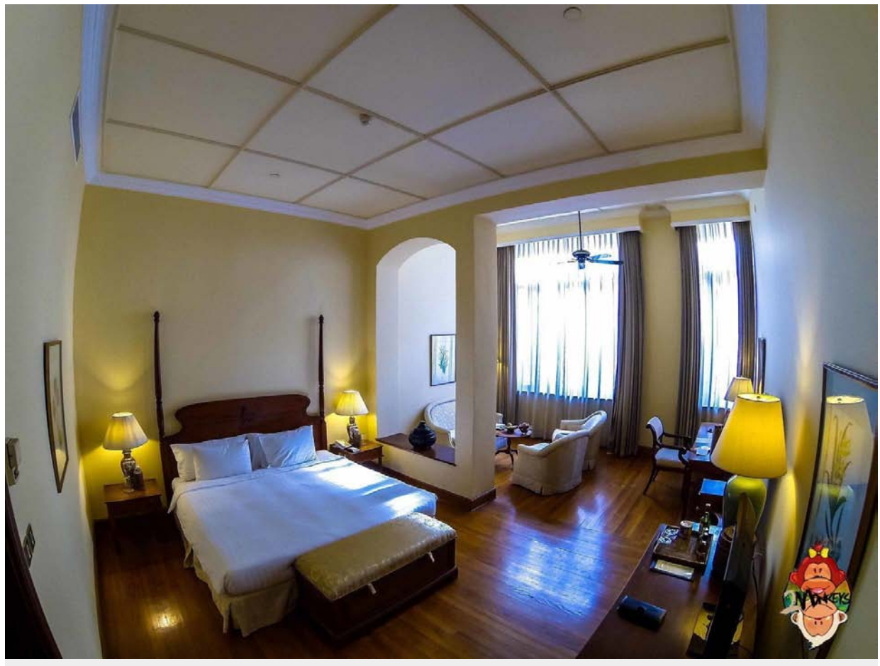
The Strand Hotel Yangon: Its Past Present and Future – My Deluxe Suite Room

The suite was marvellous! It has a teak wood flooring, high ceiling with floor to ceiling curtains and windows, something you would expect from a colonial style property. Modern touches are everywhere but did not surpass the glorious and possessed luxurious feel. The bathroom was covered in classic white tiles, spacious and clean with separate tub and showers. Toiletries were placed in ceramics with a small piece of Thanaka branch used traditionally in Myanmar as a cosmetic paste for sun rays protection.