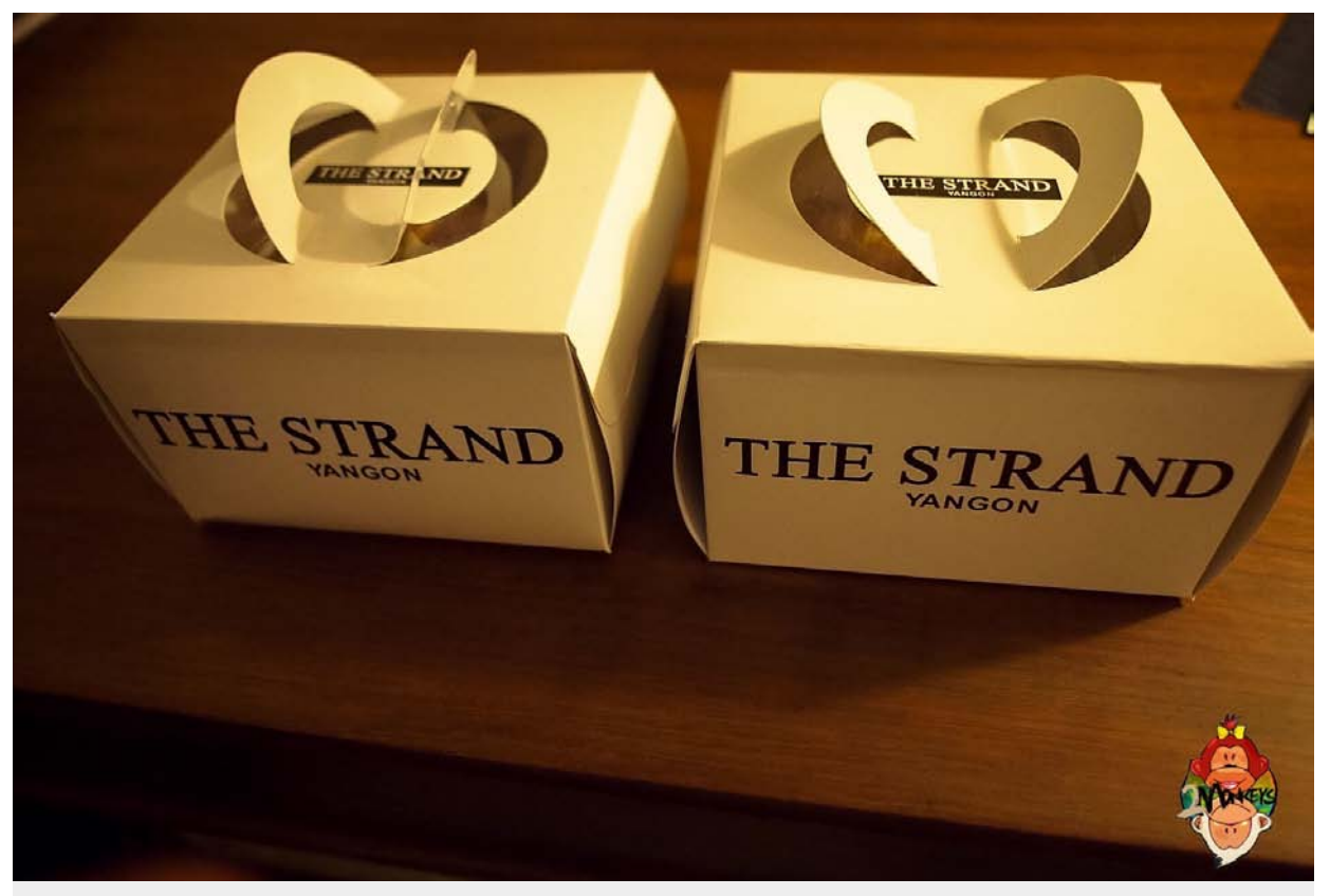
The Strand Hotel Yangon: Its Past, Present and Future – Our Breakfast Box for Takeout

the old decades, this is where French Merchants seal their deals; British civil servants play billiards and some members of the Burmese elite sipping their beers. Now, it's a place popular for its Strand Sour cocktail where tourists, businessmen and locals meet for a social drinking. While the restaurant is famous for its house version of Lobster Thermidor, it's a must for every visitor of Yangon. Unfortunately, the restaurant is closed for a private function when we visited. We also checked out The Spa at The Strand Yangon, which offers a comprehensive treatment menu, including a Traditional Myanmar Massage, Signature Strand Massage, and Bathing Ritual.