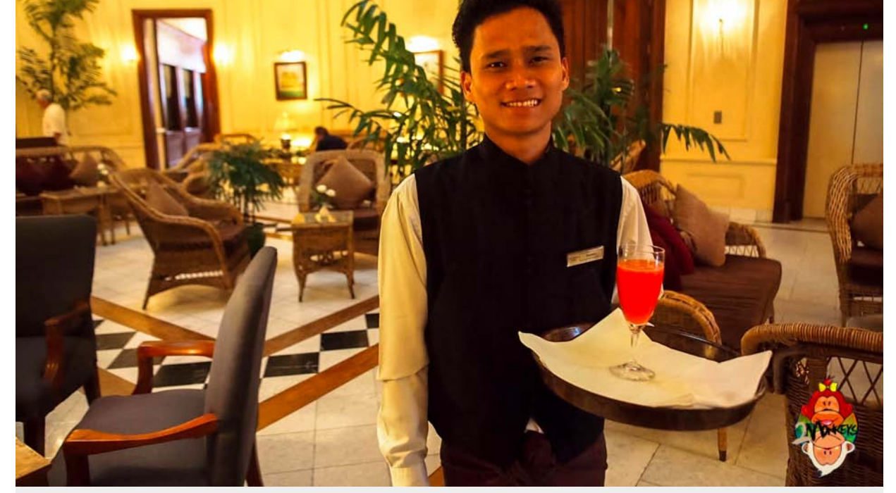
The Strand Hotel Yangon: Its Past, Present and Future – Timeless Burmese Hospitality

The staff were wearing their traditional Longyi uniforms and very accommodating. We were met by the Operations Manager after settling ourselves from our suites and gave him a brief of our very early flight to Bagan the next day for The Strand Cruise Experience. We had a quick visit to the restaurant, café and the famous Sarkies Bar.