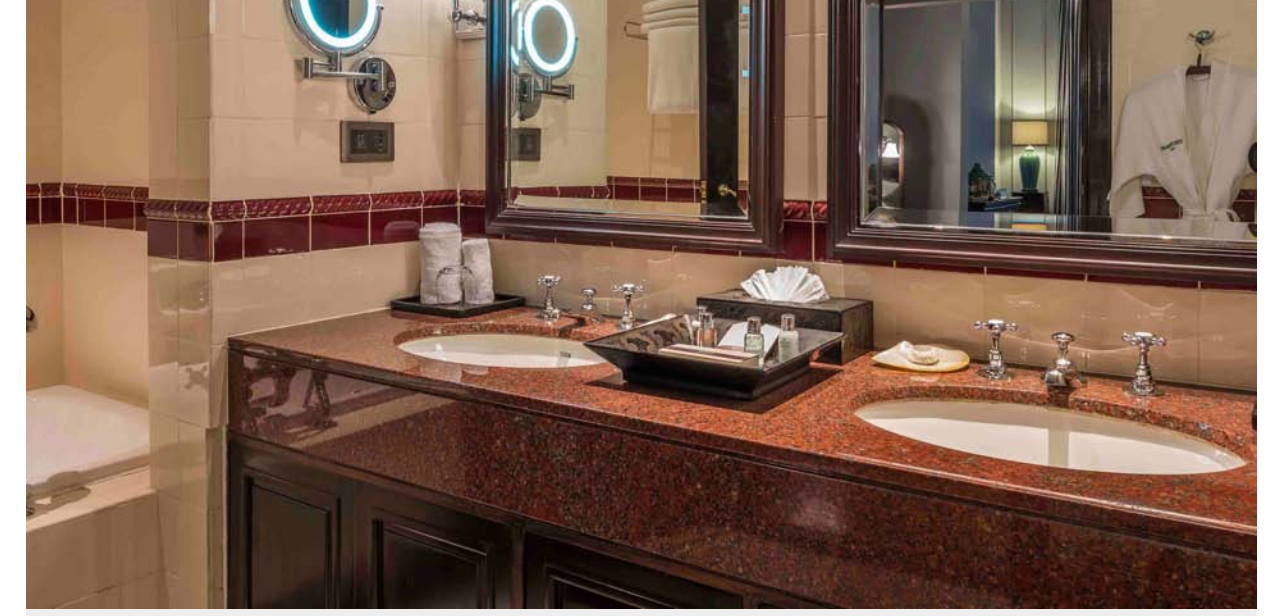
The Strand Hotel Yangon- Its Past Present and Future – New look of the bathroom

The hotel's gourmet dining restaurant, the Strand Signature Restaurant, renowned as Yangon's most elegant dining room, will be re-open as the city's finest dining pop-up outlet only open during high season and lead by a Michelin-starred chef. The casually elegant Strand Café, which overlooks the bustle of the Yangon Road, will serve a menu of Burmese and Western dishes for breakfast and lunch, and continue to be the setting for the famous Strand afternoon tea, which will be preserved and expanded with more British and Burmese delicacies. The café's traditional rattan furniture and black lacquer ceiling fans will be complemented with a new colour scheme, accented in the traditional Burmese longyi uniforms of the staff.