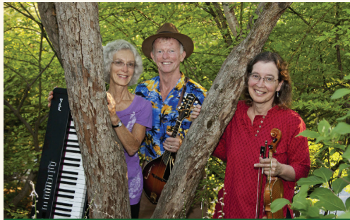
Out of the Wood

Admission is $10, $5 for those younger than 26. For more information, please visit phxtmd.org .