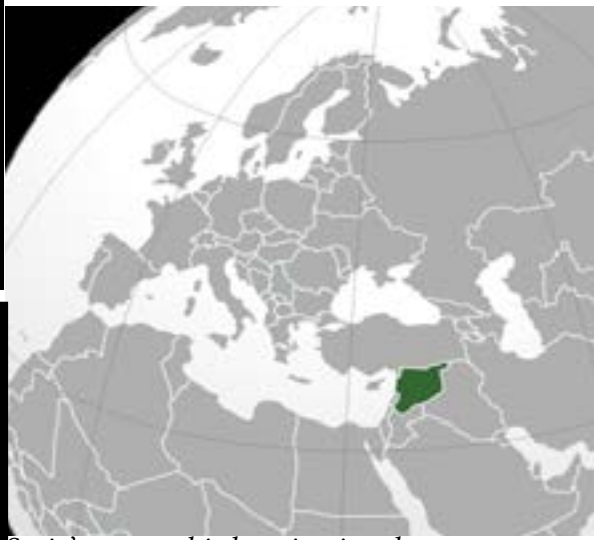
Syria's geographic location in relation to the world. (L'Americain)

Should this be left up to the United Nations? Should we be involved in the internal affairs of foreign nations? The main catalyst for those who wish to use military force in Syria was, of course, the recent chemical weapons attacks.