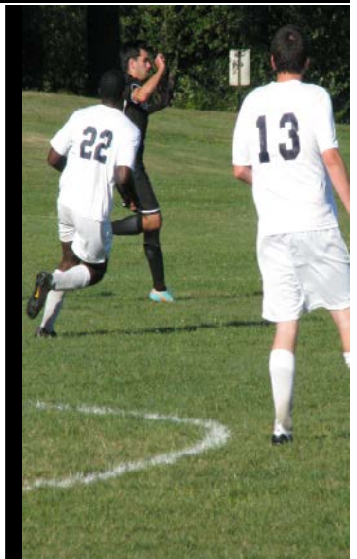
GOOOOAL! Players run down the PSU-WB soccer pitch.