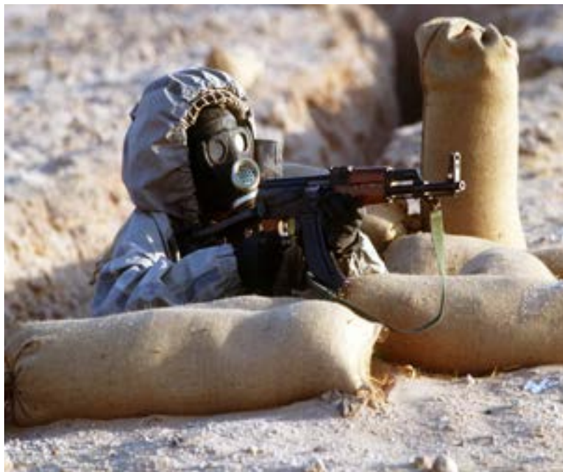
A Syrian soldier wearing a Soviet-made chemical -biological warfare mask.

Syria has been in the news a lot lately. But how did it really all start? In March 2011, small protests against Assad began and people who protested were arrested. By the next month protests had spread across the country and Assad's regime responded with violence. This caused a portion of the Syrian army to break off and become the rebel group known as The Free Syrian Army. Not long after this it developed into a civil war that is still gaining momentum and terrorizing the Arab world. For two years, the Western world sat back and let the conflict continue, as civilians and refugees were caught in the crossfire. On August 21, 2013 two suburbs of Damascus were the targets of chemical weapons. The American government along with other countries believe that the Assad regime utilized the chemical weapons in order to quell the uprising and prevent the rebels from attaining power. Many other countries, including Russia are more willing to believe that it was the rebels who instrumented the chemical weapons attacks in order to draw involvement from the Western powers. Since the chemical weapon attacks, we have heard an unending call for intervention from the military industrial complex here in America. Again, much like Iraq in 2003, we are encouraged to believe that the Syrian people are in need of liberation from a tyrant. Whether or not you believe this depends on your perspective on American foreign policy. Should America continue to be the world's police force?