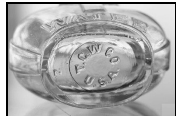
Figure 6 – TCW CO

Because our sample was entirely composed of machine-made bottles, we have dated this mark 1938-1970. However, if the same mark is found on a mouth-blown bottle, it should be dated 1901-1937.