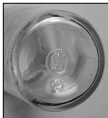
Figure 9 – Circle-W