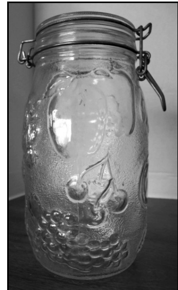
Figure 13 – Fruit Embossing (eBay)