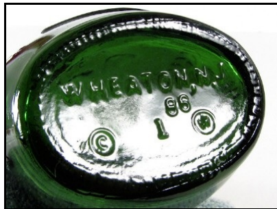
Figure 15 – Wheaton NJ (eBay)

certainly a copyright symbol. Some have copyright dates, e.g., “© 71 W H” on the front heel, and the earliest of these we have found was dated 1970. When both circles are present, either can be to the left. All of the bottles were machine made, including the ones with fake pontil scars. Examples