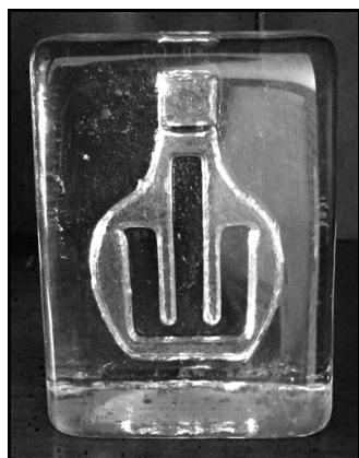
Figure 18 – WI logo (eBay)

Pages 16-17 on the early-1920s Wheaton catalog showed “100” embossed on the bases of cork-finished, Round Metric Measure Bottles in both wide- and narrow-mouth configurations. However, the glass-stoppered variations of the same bottles are embossed “125” on the heels. These may be catalog numbers, but they may indicate the capacity of the bottles in cubic centimeters. Both containers were