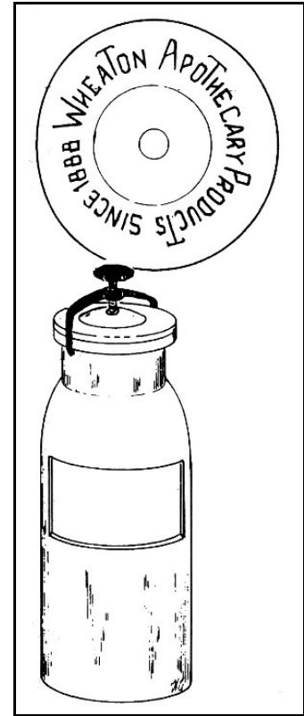
Figure 11 – Wheaton Apothecary (Creswick 1987:143)

Toulouse (1971:527) claimed that the WHEATON GLASS CO. mark was used since about 1920. An eBay auction showed “WHEATON GLASS CO.” in an arch above “N.J.” (inverted arch) on the base of an elaborately decorated green bottle or vase (Figure