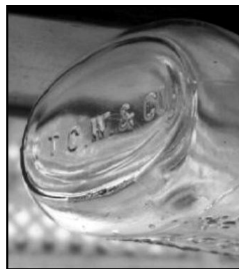
Figure 8 – TCW&CO (eBay)

The logo (with a clear ampersand) appeared in an eBay photo of a mouth-blown, colorless, oval, drug store bottle, and we have examined a single other example of the mark (Figure 8). The logo could have been used any time between 1888 and 1901