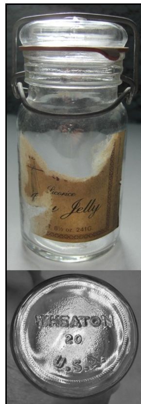
Figure 17 – Wheaton U.S.A. (eBay)

Pages 16-17 on the early-1920s Wheaton catalog showed “100” embossed on the bases of cork-finished, Round Metric Measure Bottles in both wide- and narrow-mouth configurations. However, the glass-stoppered variations of the same bottles are embossed “125” on the heels. These may be catalog numbers, but they may indicate the capacity of the bottles in cubic centimeters. Both containers were