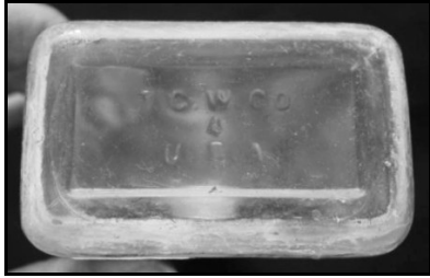
Figure 4 – TCW CO (eBay)

All marks included U.S.A. below the company name or a patent date (e.g. PAT. APR 18 / 98 on the base of a Red Star Oval bottle). In our sample, full punctuation was always present, and the “O” in “CO.” was always