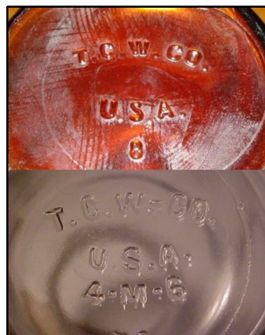
Figure 3 – TCW CO (eBay)

Similar to the mark above, this, too, was dated “since 1888” by Toulouse (1971:44, 492, 527). Griffenhagen and Bogard (1999:128) dated this mark as used from 1888 and 1900 in one place and 1900 to 1920 in another. Where Toulouse failed to differentiate between the marks (see next entry), Griffenhagen and Bogard showed them as being used sequentially (Figure 3). A slight variation of the mark (T.C.W.-CO.) was shown on the table of glass trademarks compiled by Owens-Illinois in 1964, along with the Circle W (Berge 1980:83). The mark with the initials, however, was no longer present in 1982 (Emhart 1982:74-75).