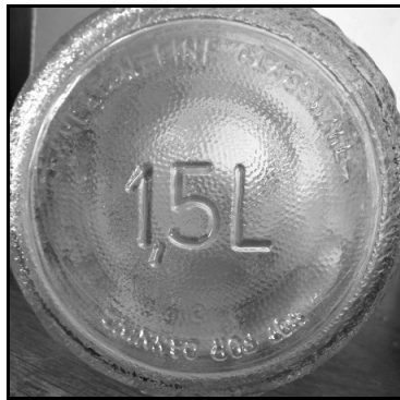
Figure 12 – Wheaton Fine

Our sample included a single jar (from an ebay auction) embossed on the stippled base “WHEATON FINE GLASSWARE / NOT FOR CANNING” in a circle around the edge with “1,5L” in larger characters above “©” (Figure 12). The body of the jar was also stippled and covered with embossed designs of various fruits (Figure 13). The term “NOT