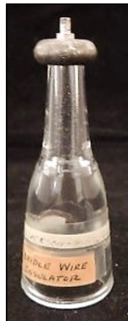
Figure 1 – Bridle Wire Insulator

century flasks – although all were machine made. Many of those even sported a fake pontil scar on the base (Figure 2). By 1974, the plant had produced more than 1.5 million flasks. Wheaton issued at least 12 series that included Great Americans, Lunar or Astronaut, Star, Christmas, Campaign, American Inventor, Early American Patriots, American Religious, American Military Leaders, American Writers, Evangelists, and Special Series (McKearin & Wilson 1978:700-704). In the following section, we have listed the marks alphabetically. For a chronological order, see Table 1 in the Discussion and Conclusions section.