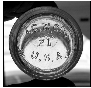
Figure 5 – TCW CO

capitalized. Various letters or numbers may appear between “TCWCo” and “U.S.A.”