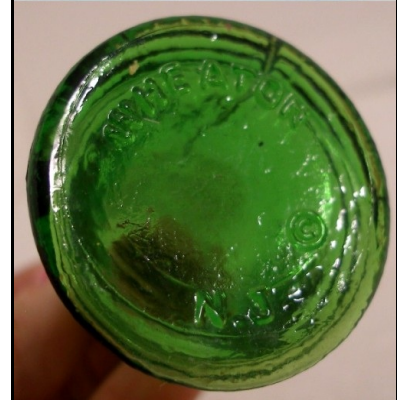
Figure 16 – Wheaton NJ

we have seen suggest that the mark was used only during the Wheaton Industries period, from 1970 to 2007, although the Circle-W probably disappeared in 1996. There were at least three variations: