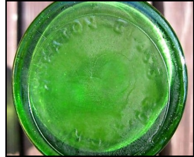
Figure 14 – Wheaton Glass Co.

Most (probably all) of the figural and commemorative bottles were embossed “WHEATON, N.J.” (Figure 16). All had either Circle-C alone or both Circle-C and Circle-W logos, usually below the Wheaton name – but a lone Circle-C could appear above it. The © was almost