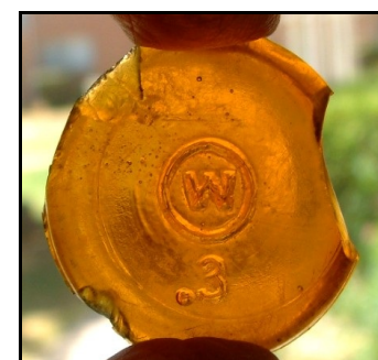
Figure 10 – Circle-W

Colcleaser (1965:34) showed a colorless Cal-Lac bottle with a continuous-thread finish and a swelled neck marked on the base with what he called a “‘W’ within a circle.” The mark often appeared with “WHEATON, N.J.” after 1970, so the only time it was apparently used exclusively was between 1946 and 1970. One characteristic, almost certainly intentional, helps separate this mark from the Circle-M logo used by the Maryland Glass Corp. In general, an “M” looks just like an upside-down “W.” However, the Wheaton “W” had the central point (where two “Vs” come together to form the “W”) raised upward, making the letter distinct (Figure 9). It is highly probable that a normal “W” as well as the raised point was only used prior to 1971, but the Raised-Point-W was used exclusively after that date (Figure 10).