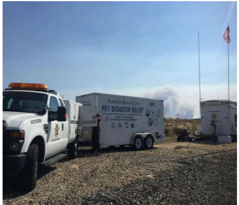
San Diego County of Animal Services (SDAS) rescued this pup found near the Border Fire with burns to all four pads of his feet. SDAS cleaned and medicated his injuries and bandaged his paws at a mobile unit that was paid for in part with donations from the TTCA. SDAS deployed the mobile shelter to a receiving area near the fire.