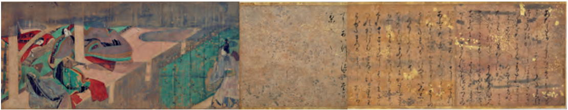
Fig. 2 The Divine Princess at Uji Bridge (Hashihime) , Chapter Forty-Five, Illustrated Handscrolls of the Tale of Genji (Genji monogatari emaki) . Late Heian period, early twelfth century. Painting: colors, ink, and shell white on paper; calligraphy: gold and silver foil and dust on dyed paper, height 22 cm. Tokugawa Museum of Art, Nagoya.

In contrast, the album format uses only the briefest excerpts from the tale, either short prose passages or one to three poems, to encapsulate the work in a concise manner. Albums are therefore not digests; their short excerpts never explain the plot, characters, or setting as that genre of paratexts had begun to do by the fourteenth century. That is not to say that the producers of the Genji Album did not take full advantage of the various digests, commentaries, character charts, dictionaries, and other tools for understanding the universe of the tale. Indeed, as we shall see, the men who made the album were not only consumers, but producers of such texts. The album, however, works best as a supplement to a full Genji manuscript, and for readers already knowledgeable about the tale, allows them to visualize scenes more clearly and to understand familiar passages and poems in a new light. The unique selection and coordination of Genji texts and images in all formats, whether scroll, book, or album, are always suggestive of how contemporary audiences understood the tale. The Genji Album in the Harvard collection offers a particularly important point of view in this regard, both as the sole surviving album predating 1600 and because of the group of individuals behind its creation. 5