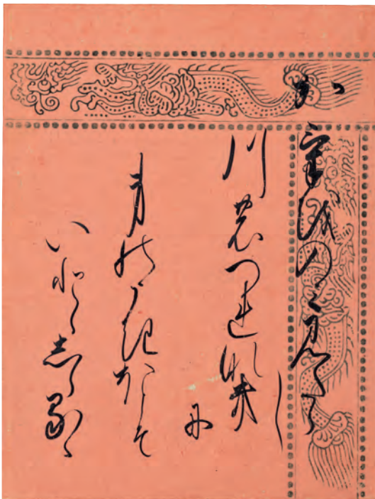
Fig. 6 Sanjōnishi Sanetaka (1455–1537), calligraphy for Leaves of Wild Ginger (Aoi), Chapter Nine from The Tale of Genji Album . 1510. Ink on paper, 24.3 × 18.1 cm. Harvard Art Museums, Cambridge.

The calligraphy of the Genji Album is brimming with visual appeal, and yet this effect was no doubt secondary in importance to the sum of the calligraphic and courtly lineages it represented, the "aristocratic body" that is inscribed into the work itself. Each of the hands were as indicative of the identity of the calligraphers as their names and court rank, which in fact endowed the leaves with value. The album becomes, through the hands of its six calligraphers, both a manual reproduction of the Genji and a calligraphic representation of