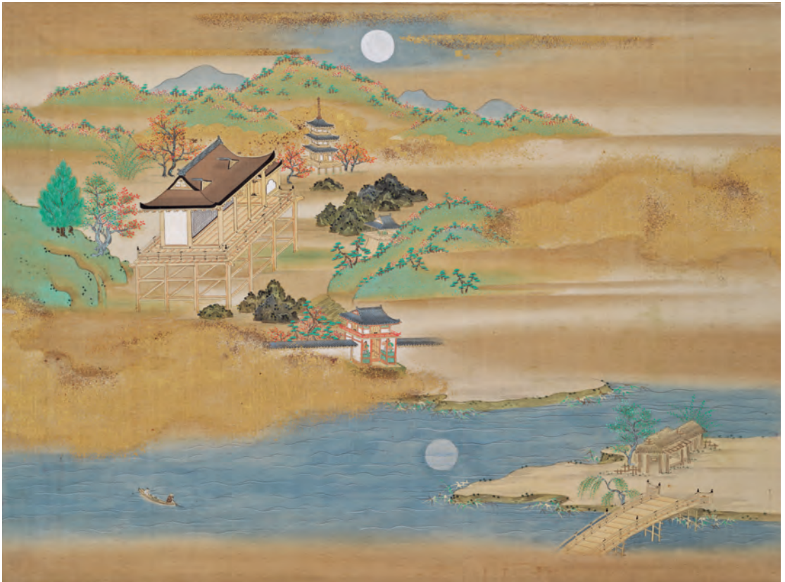
Figs. 12, 13 The Tale of Genji Album . Frontispiece (right), finispiece (left) attributed to Tosa Mitsuoki (1617–1691). Ink, colors, and gold on silk, 34.1 × 42 cm. Harvard Art Museums, Cambridge.

characters on their own, and when read in conjunction with the adjacent prose and poetry excerpts, the pairs of leaves give expression to a panoply of their thoughts, concerns, and actions. The album's producers may not have been especially sympathetic to such characters but may have been simply responding to the centrality of women in the tale and their pivotal role within the marriage politics of the Heian era. It can be just as rewarding therefore to analyze the album's juxtapositions of paintings and texts within the context of Murasaki's eleventh-century tale. In this way, viewers of the album today need not limit themselves to considering only what it meant to its audience in 1510, and it is in this spirit that I offer these analyses of the album's texts and images. While paying close attention to sixteenth-century