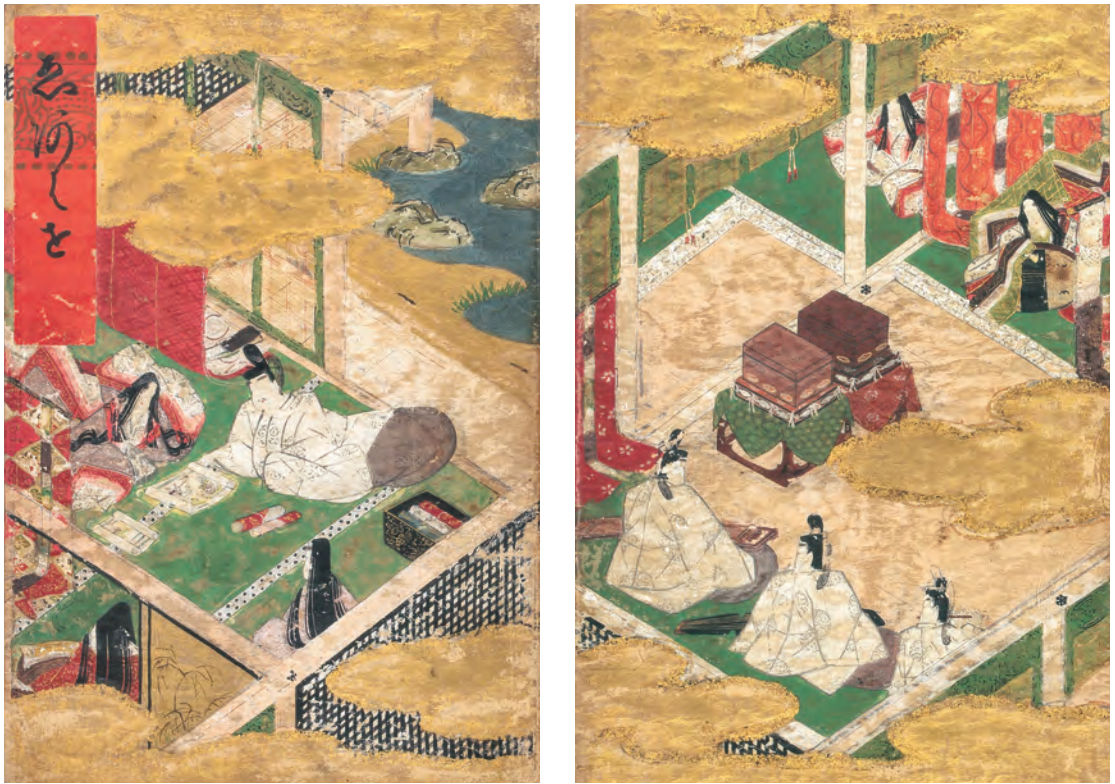
Fig. 8 A Contest of Illustrations (Eawase) , Chapter Seventeen of The Tale of Genji . By Tosa Mitsunobu. Circa early sixteenth century. One thread-bound book with paintings on front cover (left), and back cover (right). Ink, colors, and gold on paper, 25.4 × 17.2 cm. Tenri University Library, Nara.

sible scenes for illustration, and though the patron no doubt made his preferences known, he, the coordinators, and Mitsunobu would have worked from preexisting templates. The majority of paintings in the 1510 Genji Album in fact depict scenes included in picture manuals and digests of the period, which provided patrons of Genji pictures with a menu of text and image options for every chapter in the tale. 49 Sanetaka was known to have borrowed, at least once, a five-volume “ Genji picture manual” ( Genji eyō sōshi ) for another project years later. 50 Mitsunobu had in fact been catering to patrons and coordinators armed with such manuals since early in his career. In 1476, for example, the courtier Nakanoin Michihide (1428–1494) offered comments on several Genji paintings executed by the Painting Bureau