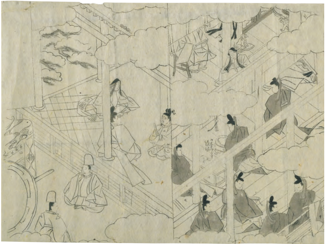
Fig. 10 Copies of Book Cover Paintings by Tosa Mitsunobu . By Sumiyoshi Gukei (1631–1705). Dated 1675. Section showing the designs for The Lady of the Paulownia-Courtyard Chambers (Kiritsubo), Chapter One of The Tale of Genji , front cover (left) and back cover (right). Single handscroll, ink and light color on paper, paper sizes differ: sheets 1–10: 27.3 × 348.9 cm; sheets 11–26: 23.5 × 417.3 cm, total width 766.2 cm. Tokyo National Museum.

native compositions. The book-cover drawings also add more to our understanding of what readers in Mitsunobu's day considered to be the most defining moments of a given Genji chapter. Take for example the two drawings for the book covers of Chapter One, shown here, where on the front cover we find young Genji meeting the Korean physiognomist whose prognostication about Genji's future hovers over the entire tale. It is in part based on this fortune telling that Genji's father, the Emperor, decides to make him a commoner, and thus his coming-of-age ceremony is held in the private quarters of the imperial residence, rather than the official hall of state,