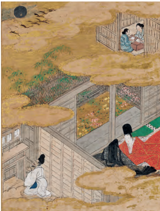
Fig. 7 Tosa Mitsunobu (act. ca 1462–1525), painting for The Lady of the Evening Faces ( Yūgao ), Chapter Four from The Tale of Genji Album . 1510. Ink on paper, 24.3 x 18.1 cm. Harvard Art Museums, Cambridge.

The sheer length of The Tale of Genji meant that each of the fifty-four chapters offered countless pos-