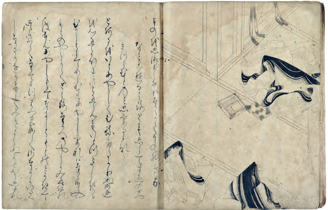
Fig. 3 A Boat Cast Adrift ( Ukifune ), Chapter Fifty-One of The Tale of Genji . Artist and calligrapher unknown. Kamakura period, thirteenth century. Thread-bound book, with illustrations in ink on paper, 23.7 × 19 cm. The Museum Yamato Bunkakan, Nara.

waned over time, the spiritual identity of the emperor and thus the court's ideological and symbolic influence survived and remained desirable and valuable to those on the outside. Rulers of the Ashikaga Shogunate, for example, belonged to a lineage of imperial princes turned commoners who took the Minamoto (a.k.a. Genji) surname, like the eponymous hero of The Tale of Genji . For warlords like the shogun Ashikaga Yoshimitsu (1358–1408), Genji's ability to achieve the exalted status of honorary retired emperor ( jun daijō tennō ) as a commoner was aspirational. 7 Murasaki Shikibu's characterization of her commoner hero as a rightful ruler dispossessed, but with the undeniable radiance of a Buddhist monarch, most certainly played a part in earning the shogun's admiration as he sought his own kingly power. Even for men without a professed Minamoto bloodline, however, the dra-