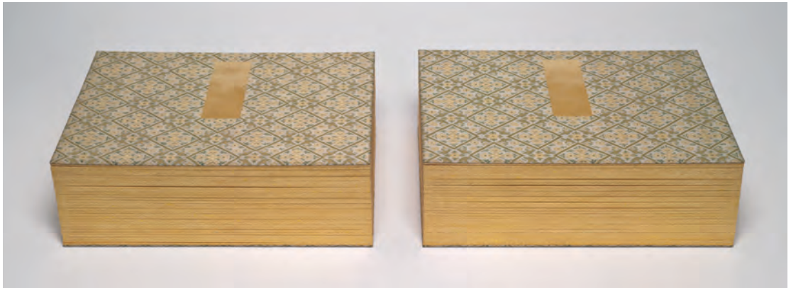
Fig. 1 The Tale of Genji Album , 1510. Two volumes, remounted in 1998. Paintings by Tosa Mitsunobu (act. ca. 1462–1525), calligraphy by Kunitaka Shinnō (1456–1532), Konoe Hisamichi (1472–1544), Sanjōnishi Sanetaka (1455–1537), Jōhōji Kōjō (1453–1538), Reizei Tamehiro (1450–1526), Son'ō Jugō (d. 1514). Overall mounting, each volume: 34.1 × 44.9 cm; 108 album leaves, 24.3 cm × 18.1 cm each. Harvard Art Museums, Cambridge. Credit: Harvard Art Museums/ Arthur M. Sackler Museum, Bequest of the Hofer Collection of the Arts of Asia, 1985.352.

narrator throughout the work also makes for a reading experience surprisingly akin to that of the modern novel. 2 At the same time, the tale's evocative description of the imperial court and the rituals of the aristocracy caused it to be regarded as the embodiment of a golden age of courtly life, especially in later eras when juxtaposed against the nobility's waning political authority.