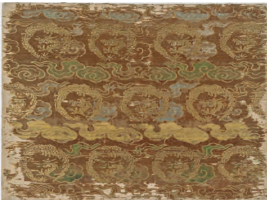
Fig. 11 The Tale of Genji Album , previous cover. Edo period (1615–1868), silk lampas, with gold and silver threads, 34.1 × 42 cm. Harvard Art Museums, Cambridge.

Based on these sketches of now lost chapter volumes and extant Genji paintings, it becomes clear that scenes that might be construed as inauspicious went unrepresented. As a rule, formal polychrome Genji paintings omit scenes depicting episodes of spirit possession, as well as childbirth, or illness (conditions that usually render a person vulnerable to an attacking spirit). The absence of such subject matter hints at the degree to which images were assumed to instantiate the things they represented. Episodes depicting behavior deemed controversial within the world of the story are also avoided in emblematic pictorial representation. Examples include Genji's abduction of the young Murasaki, which shocks the surrounding characters, or his sexual violation of Murasaki four years later at the end of Chapter Nine, the traumatic nature of which is registered through Murasaki's reaction. Given the nature of the function of albums and screens and fans of Genji , such complicated scenes might not reflect well on the patrons. And when albums and manuscript sets with illustrated covers were made