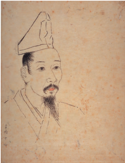
Fig. 5 Portrait Sketch of Sanjōnishi Sanetaka. By Tosa Mitsunobu. Dated 1501. Single sheet, ink on paper, 41.2 × 25.8 cm. Historiographical Institute, The University of Tokyo.

Sue Saburō's introduction to the famous courtier came by way of another coordinator overseeing the album's production, the renga poet Gensei (1443–1521). Gensei's knowledge of The Tale of Genji rivaled that of Sanetaka, and this speaks to the importance of the tale as a source for renga poetry. 28 Handbooks provided appropriate "linking" words from Genji , boiling the narrative down to discrete units, including chapter titles, character names, and seasonal motifs, that formed the building blocks for new, collectively authored chains of poetry. New genres of Genji -specific renga , in which poets composed links exclusively related to the narrative and its poetry ( Genji kotoba renga ), came to rival traditional modes of linked verse. 29 There even arose a genre known as "Genji province-name renga " ( Genji kokumei renga ), in which poets composed verses based alternately on the names of provinces throughout the realm and the titles of the fifty-four Genji chapters. 30 At the same time it would be a mistake to overstate the influence of renga over waka in terms of medieval Genji reception, and the album's creation. Waka remained the dominant poetic form when it came to the creation of new poetry inspired by Murasaki's tale, and Gensei and renga masters like him left countless examples. 31 As the analyses of the texts and images in the pages that follow will attest, an emphasis on the use of