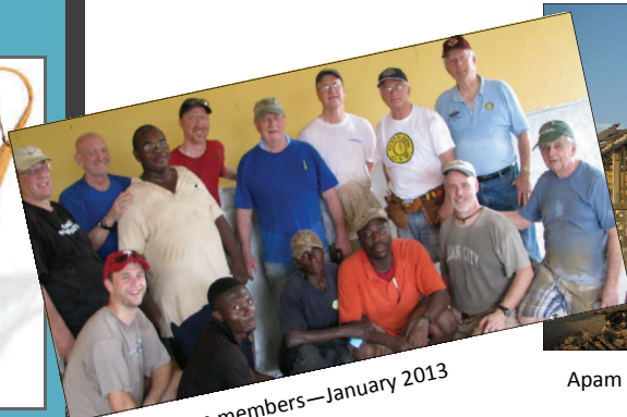
Team members—January 2013