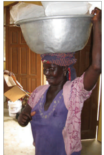
Our first customer for ice!

Your support makes it possible for Building Solid Foundations volunteers to travel to Apam in April to complete the final work on the Apam Community Cold Store blast freezer. Thank you!