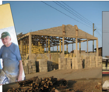
Apam Community Cold Store 2009