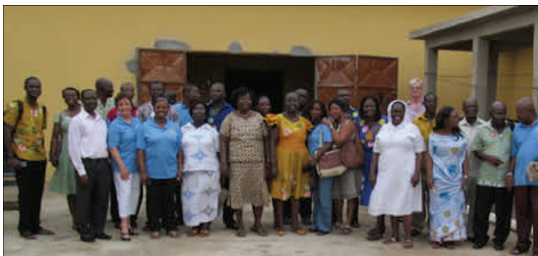
Left: Members of Rotary Club of Apam and Rotary Club of Accra toured the Apam Community Cold Store in January 2013.

With your gifts, financial support from twenty Rotary Clubs in Central Pennsylvania, and hard work by Rotarians in Apam, the Apam Community Cold Store is nearly complete.