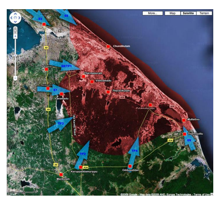
Map of the final "humanitarian operation" at Mullaitivu (Credit: David Blacker)

The LTTE conducted a large-scale withdrawal. Thousands of civilians traveled ahead of LTTE fighters as the Tigers conducted rearguard operations against the pursuing government forces. Eventually, many LTTE fighters (and the civilians who were with them) were bottled up on a flat, narrow spit of land just north of the town of Mullaitivu. Once contained, the LTTE was pounded by indirect