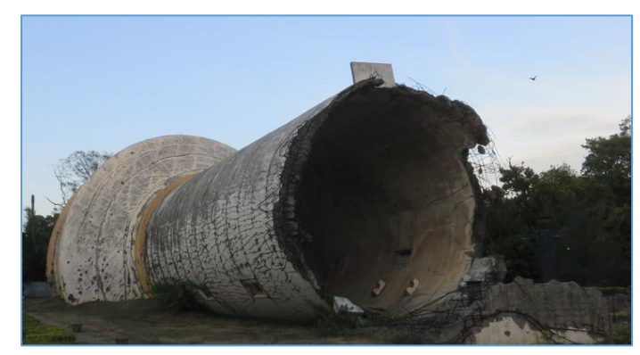
A fallen water tower in Kilinochchi bombed by Tigers during the final phase of the war.

Still, the Sri Lankan armed forces would retain their hold on the Jaffna Peninsula for the rest of the war, though it was not from lack of effort on the LTTE's