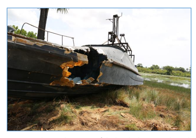
Surveying the wreckage: One of the bombed-out vessels used by LTTE Black Sea Tigers at the PTK Museum outside Mullaitivu, just north of Trincomalee, Sri Lanka.

The LTTE proved itself a highly disciplined and hierarchical organization, unflinching in its use of violence, and uncompromising in its political demands. Experts we interviewed described it as "the most ruthless terrorist organization in the