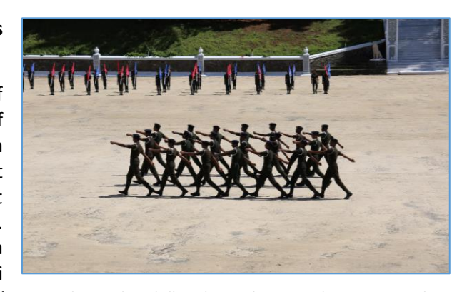
Sri Lankan cadets drill at their military academy at Diyatalawa, located in the central highlands.

The Sri Lankan civil war provides a remarkable, if controversial, example of how the application of overwhelming force was brought to bear to end an insurgency. The United States has spent the last decade and a half at war in the Middle East at a cost of trillions of dollars and thousands of American lives. The vast majority of this time was spent waging a counterinsurgency campaign against Sunni insurgents motivated by a mix of sectarianism and secular resistance to greater foreign occupation, and the fight is still ongoing. In spite of intense pressure