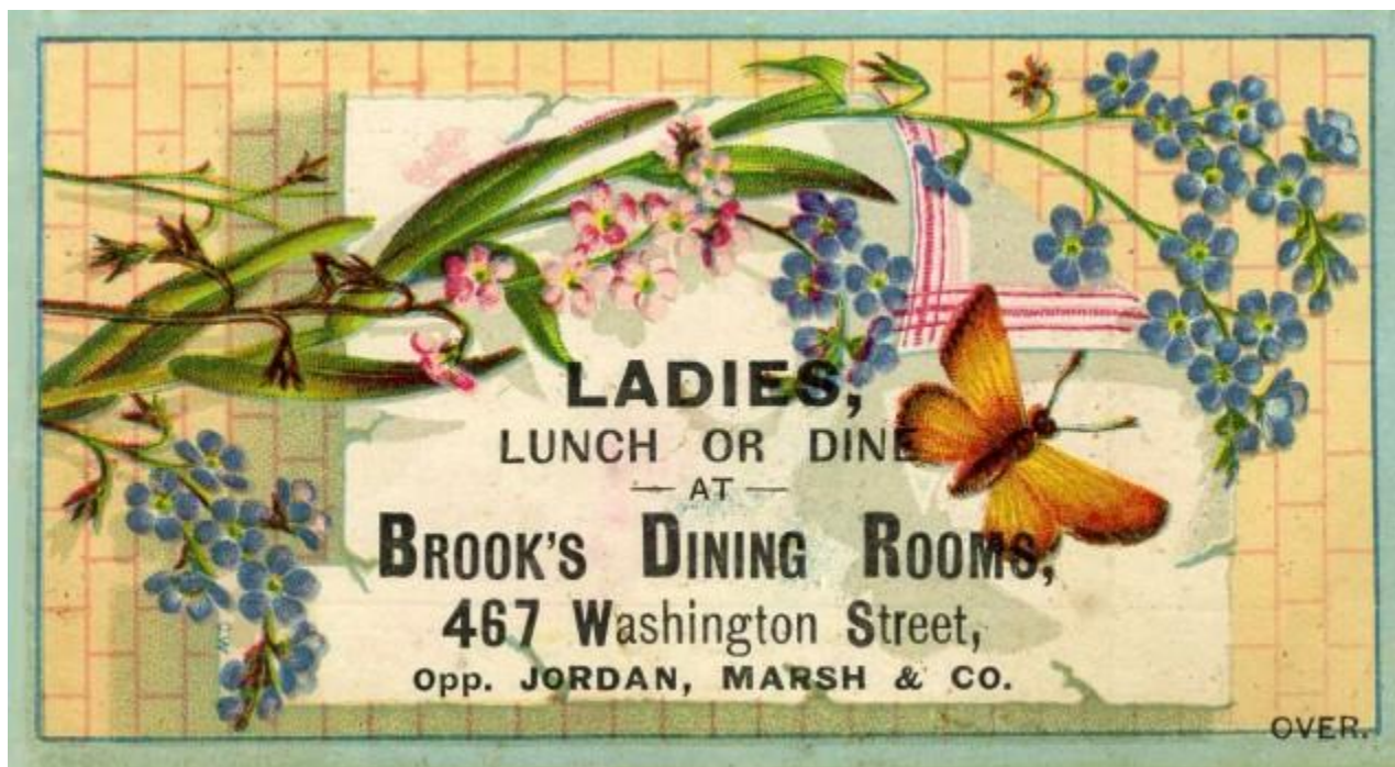
1 Brook's Dining Rooms