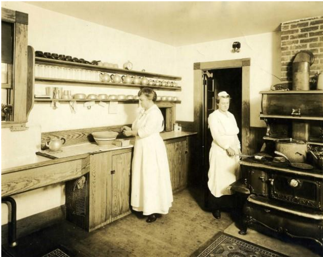
3 The kitchen at the Tabby Cat Tea Room

Tea rooms were also very much the work of native-born American women from the middle class, mostly white but with a number of Afro-American operators also. Tea rooms continued the sex-segregated tradition of American eating places, not because they refused to serve men but because most men found them too feminine. These small, dainty eating places reached a peak of popularity during Prohibition in the 1920s and early 1930s, barely surviving after World War II. With all-female staffs, they introduced a new role for women that of hostess, often employing a society woman whose role was to attract others of her circle.