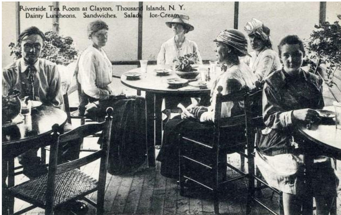
4 Riverside Tea Room, Clayton, Thousand Islands, New York

Despite tea rooms, sex-segregated dining declined in the 1920s as unescorted women began patronizing all sorts of restaurants. Clearly women were rapidly becoming a market to be reckoned with, increasing from 20% to nearly 60% of the dining public between World War I and 1927. Suddenly male restaurateurs scrambled to figure out how to please them. Cleanliness was at the top of women's list, putting diners and hamburger chains on the outs with them for some time.