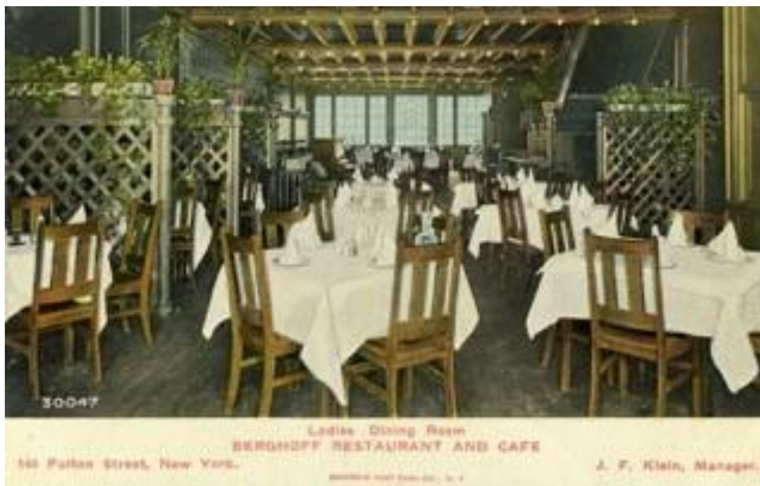
2 Postcard from Berghoff Ladies Dining Room ca. 1910, New York City

Confectionery restaurants specializing in the odd-sounding combination of oysters and ice cream became closely associated with women patrons in the 19th century. In San Francisco, a temperance restaurant of the 1850s opened a branch for women known as Winn's Confectionery, Ice Cream, and Ladies' Refreshment Saloon. Along with oysters and ice cream, Winn's supplied wedding cakes.