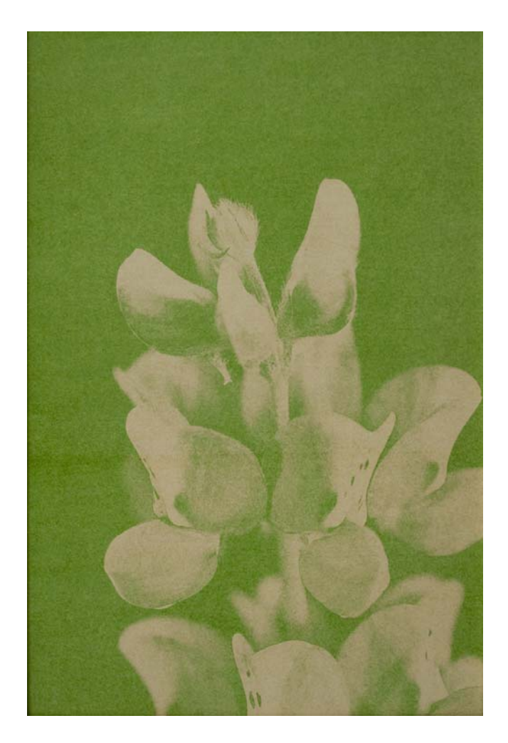
FIGURE 4. "Lupinus nanus"