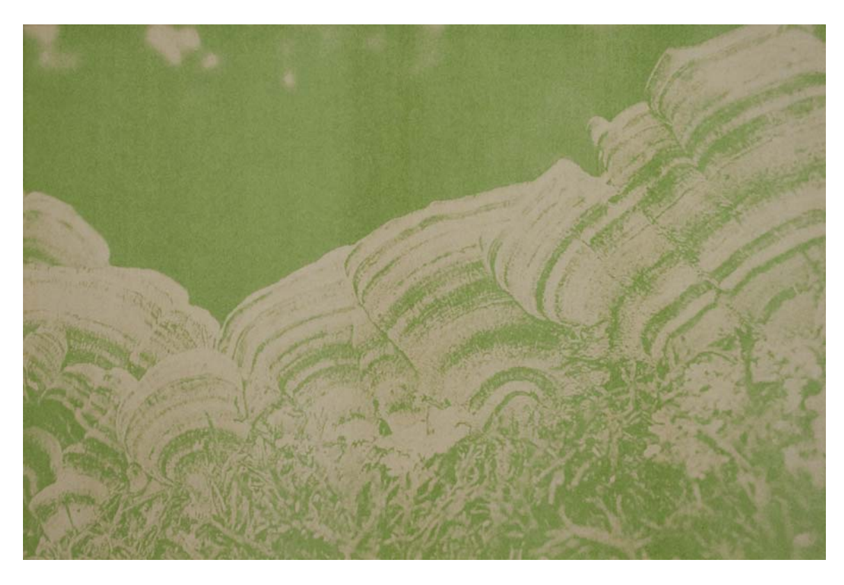
FIGURE 8. "Triametes versicolor"