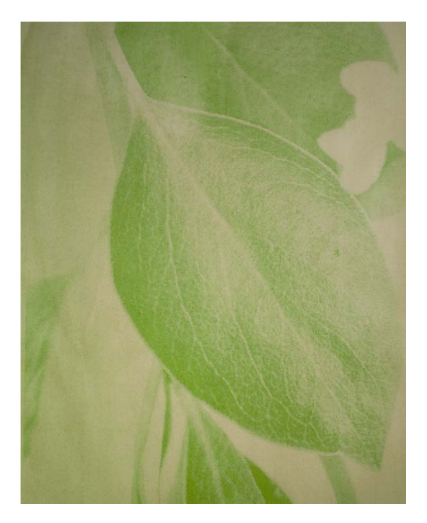
FIGURE 19. "Arctostaphylos Manzanita"