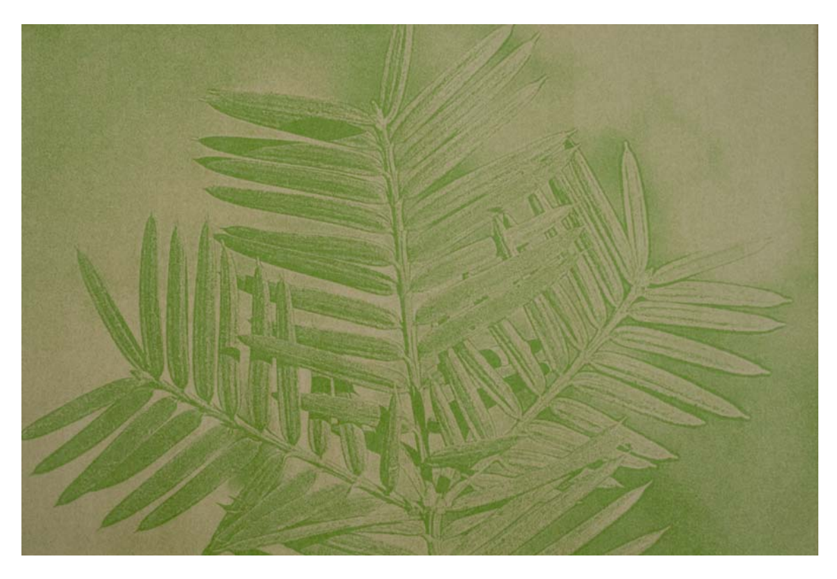
FIGURE 9. "Torreya californica"