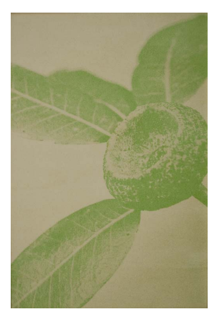
FIGURE 7. "Quercus wislizeni"