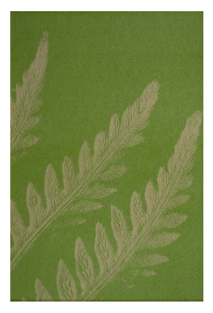
FIGURE 16. "Woodwardia fimbriata"