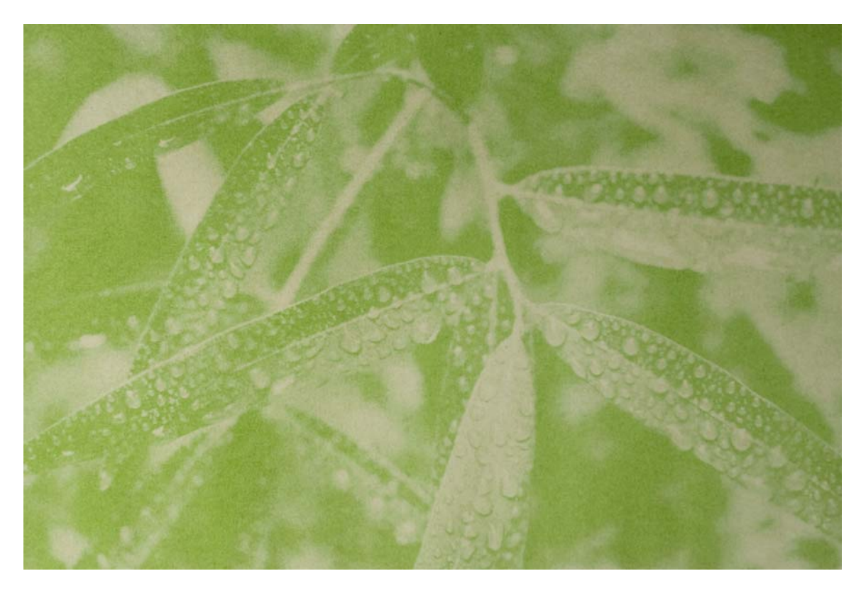
FIGURE 17. "Umbellularia californinica"