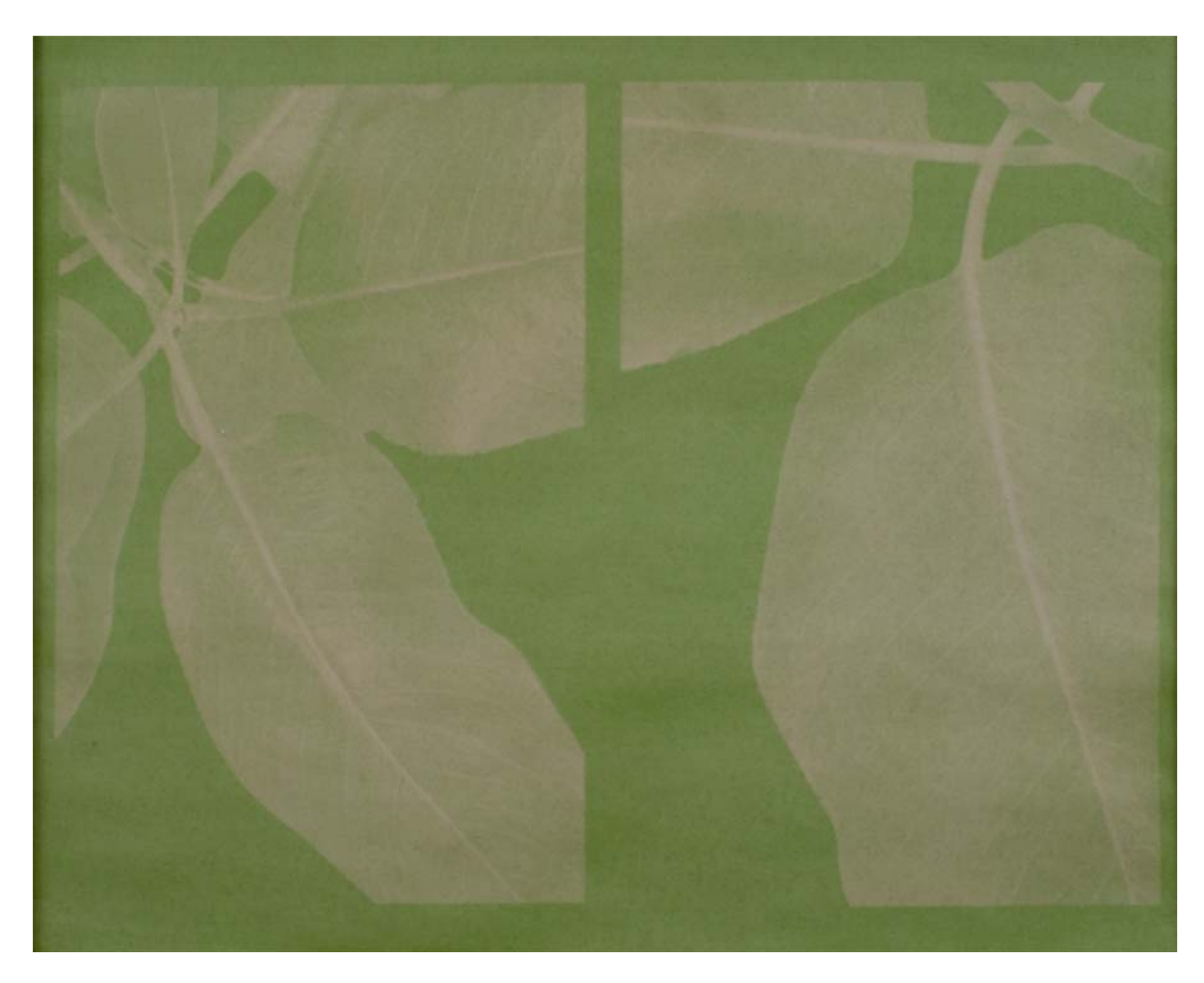
FIGURE 2. "Arbutus menziesii"