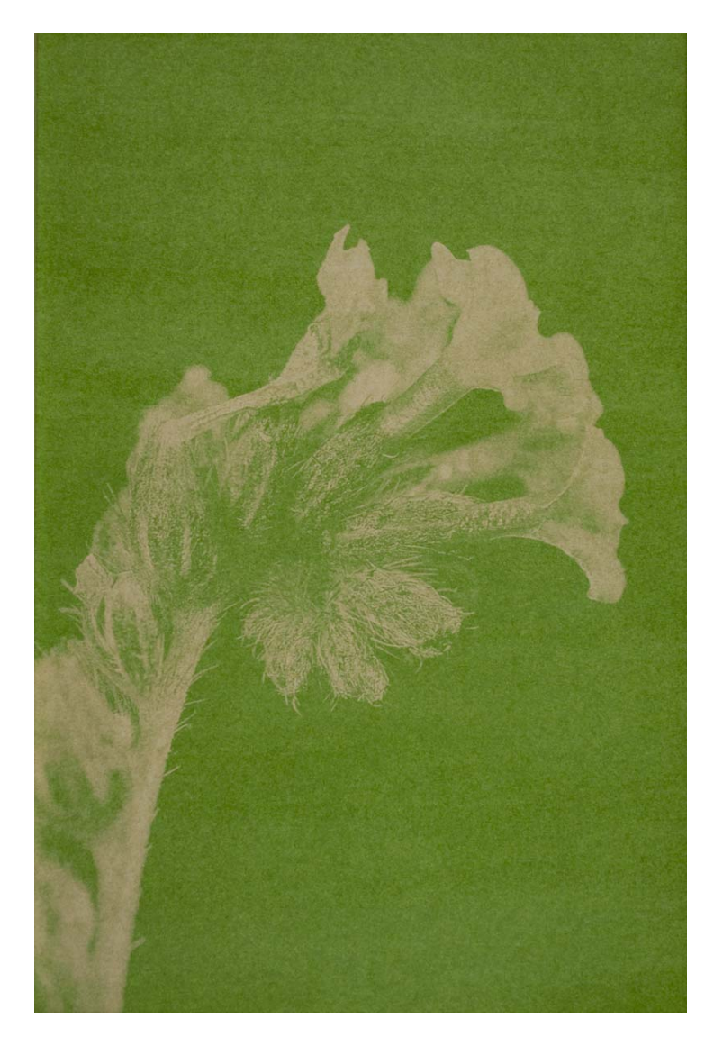
FIGURE 12. "Amsinckia menziesii var intermedia"