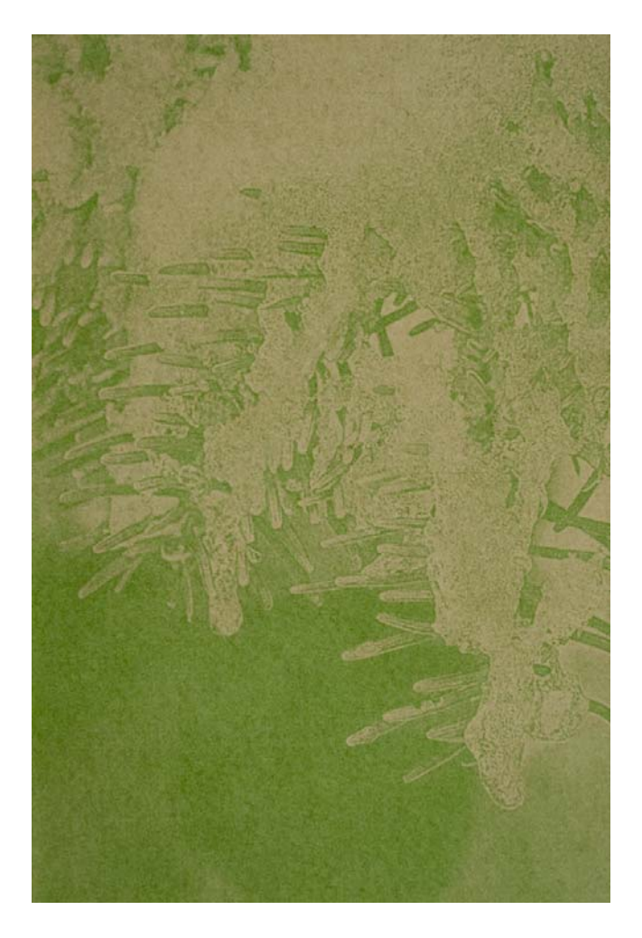
FIGURE 13. "Pseudotsuga menziesii"