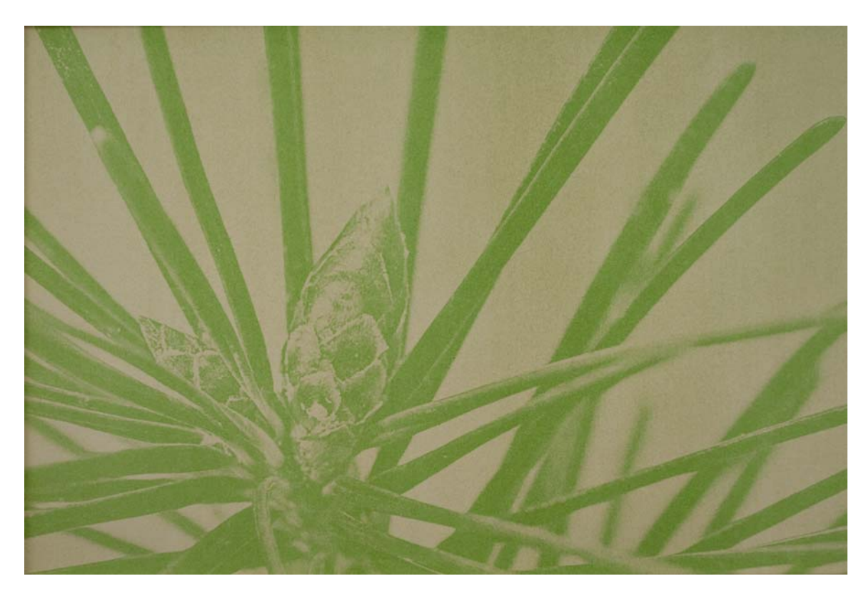
FIGURE 11. "Pseudotsuga menziesii"