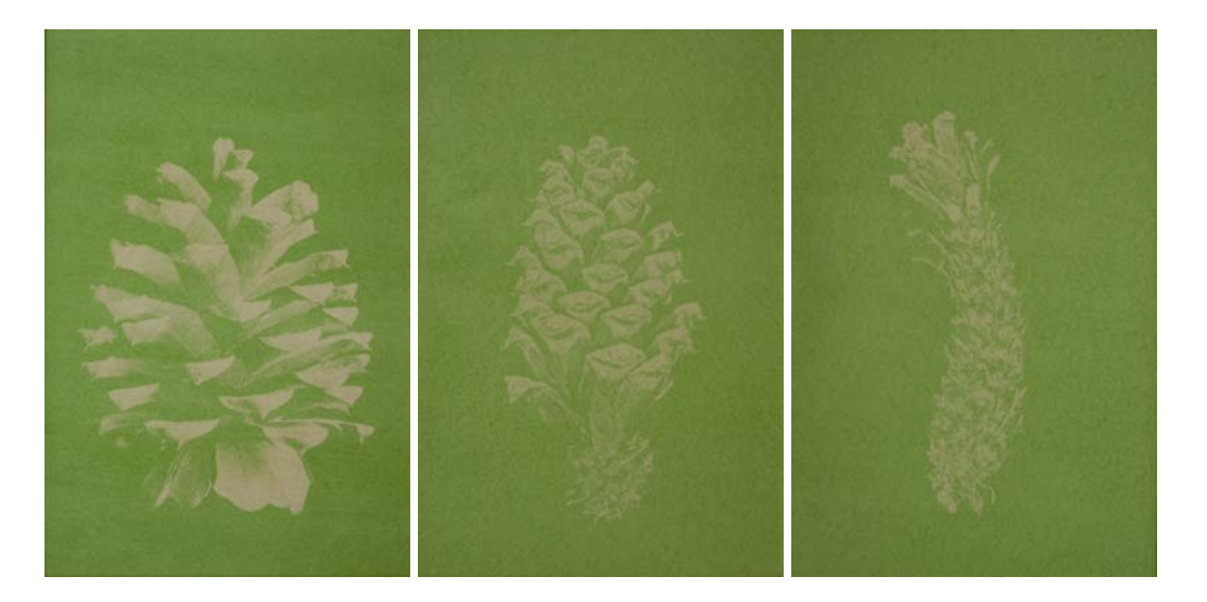
FIGURE 6. "Pinus ponderosa"