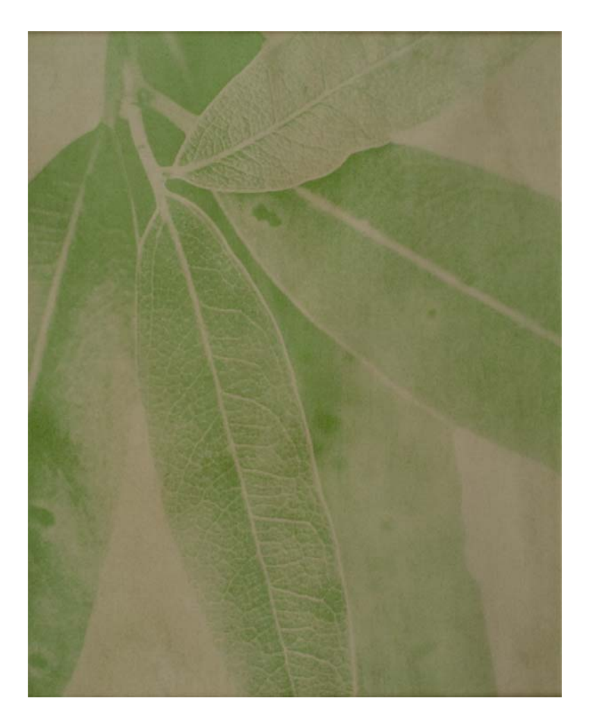
FIGURE 1. "Umbellularia californinica"