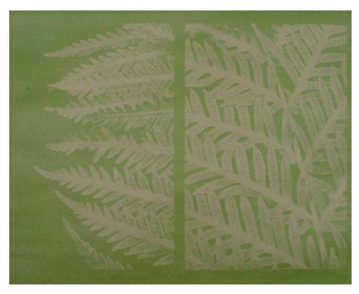
FIGURE 3. "Woodwardia fimbriata"