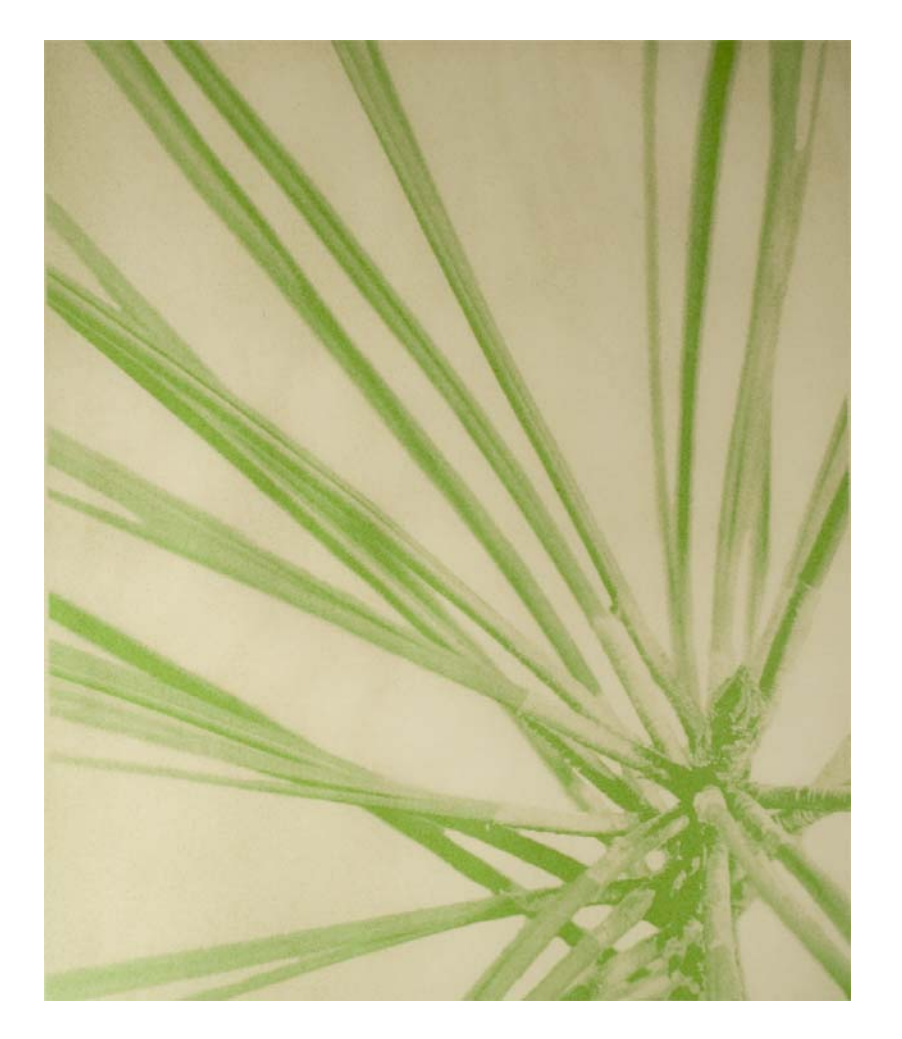
FIGURE 18. "Pinus ponderosa"