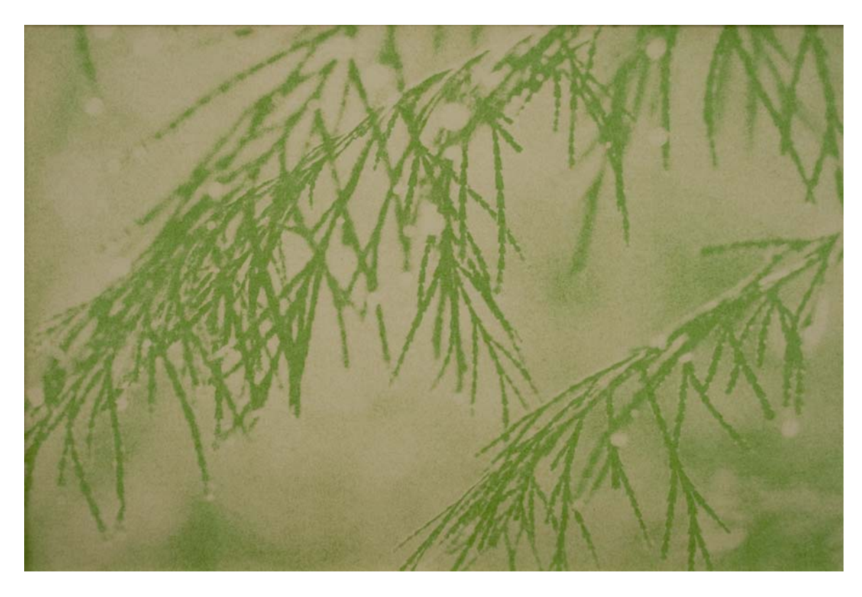
FIGURE 15. "Calocedrus decurrens"