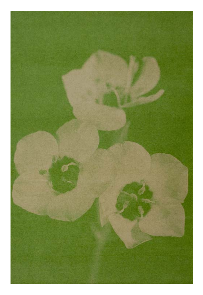
FIGURE 14. "Gilia tricolor"