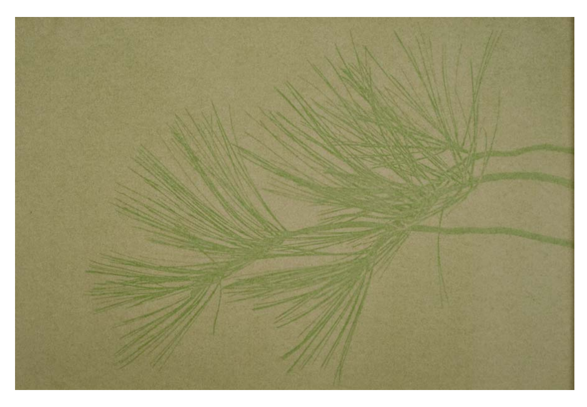
FIGURE 10. "Pinus sabineana"