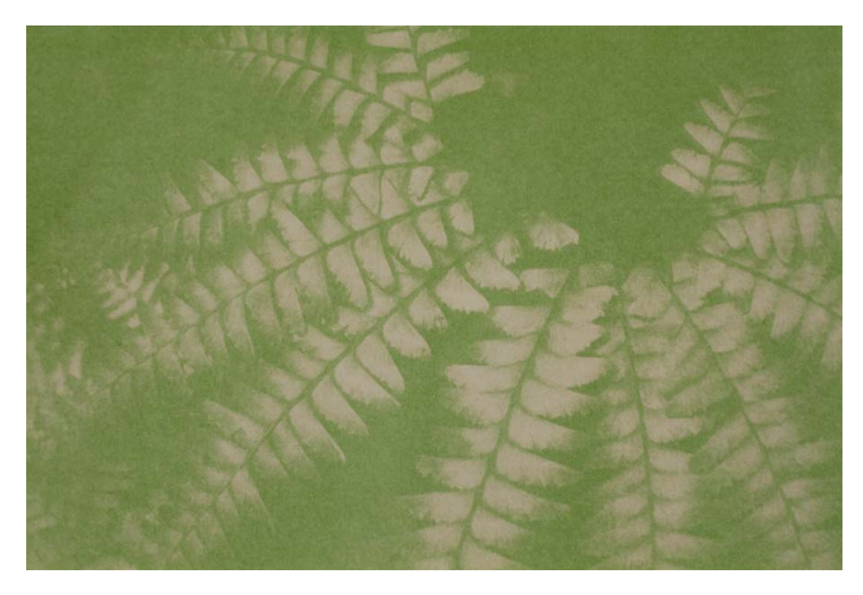
FIGURE 21. "Adiantum aleuticum"