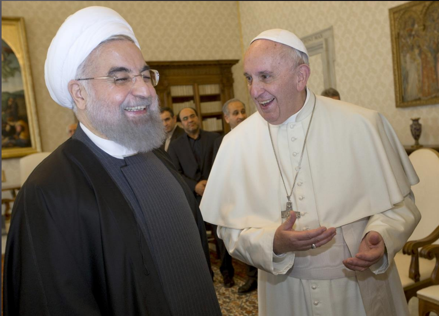
Iran – President Hassan Rouhani