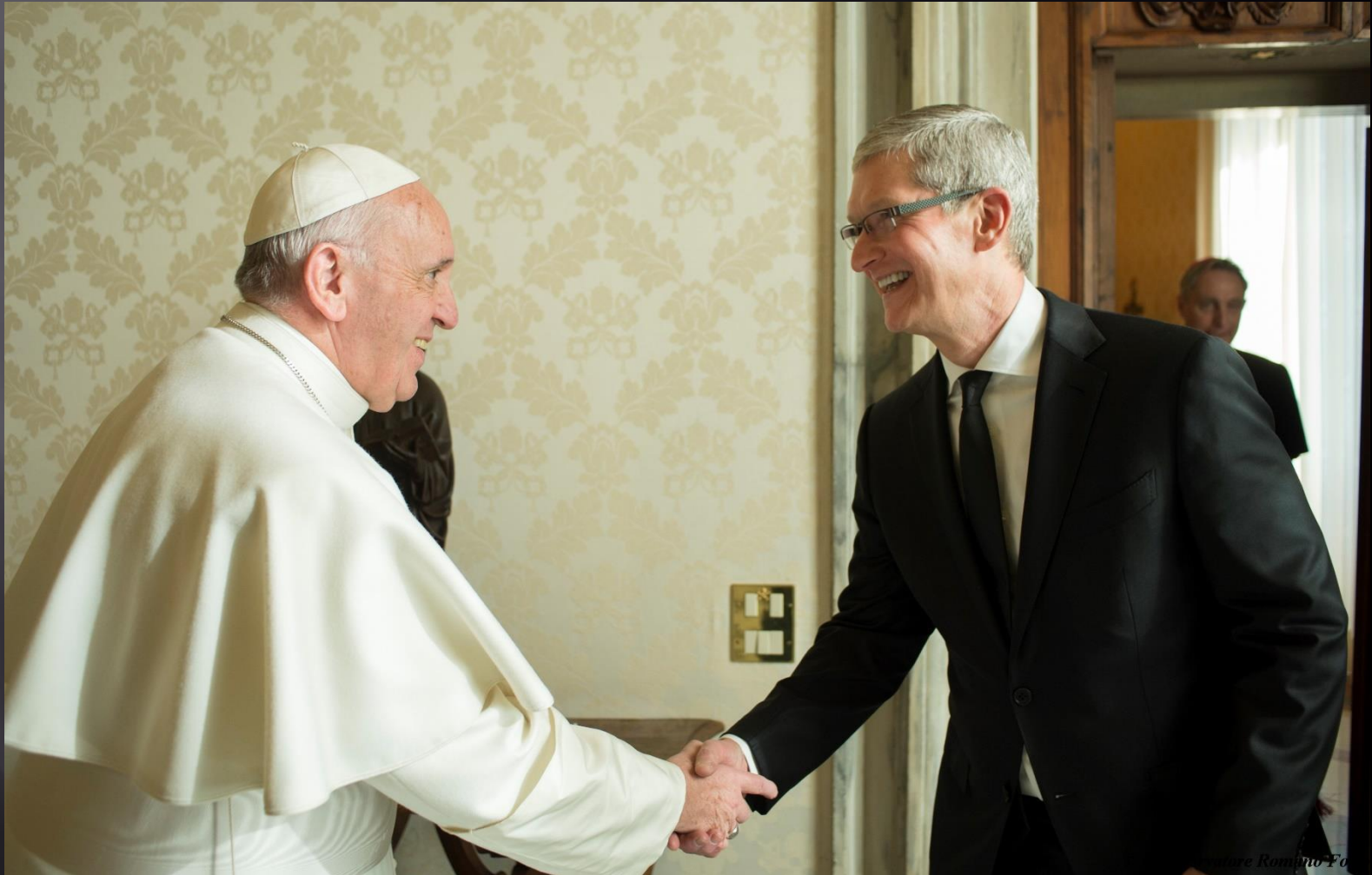
Apple – Tim Cook