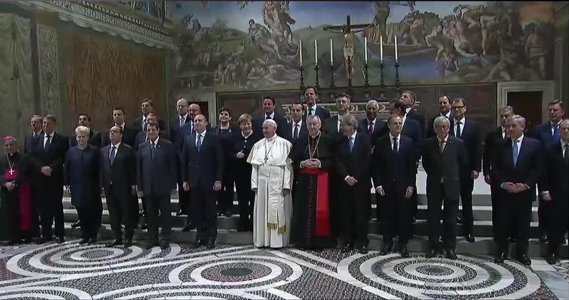
European Union Leaders