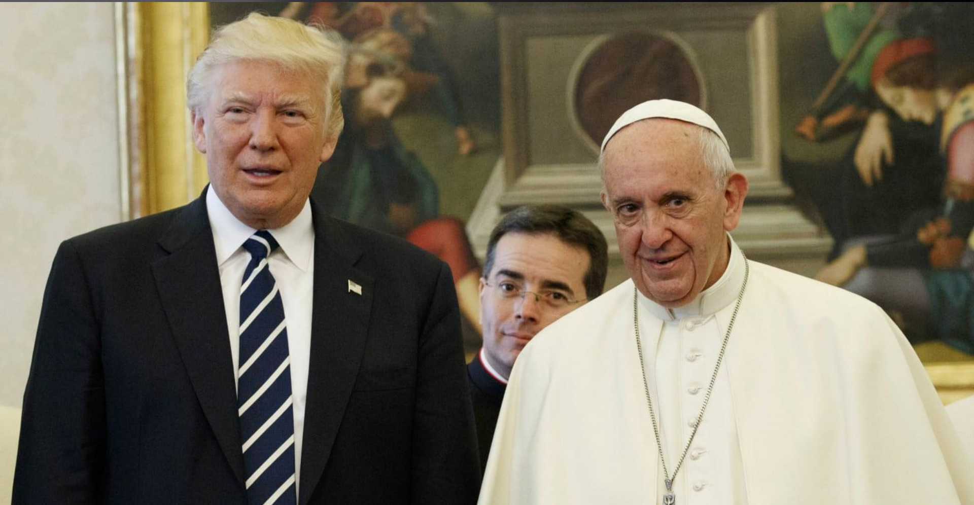
United States - President Trump