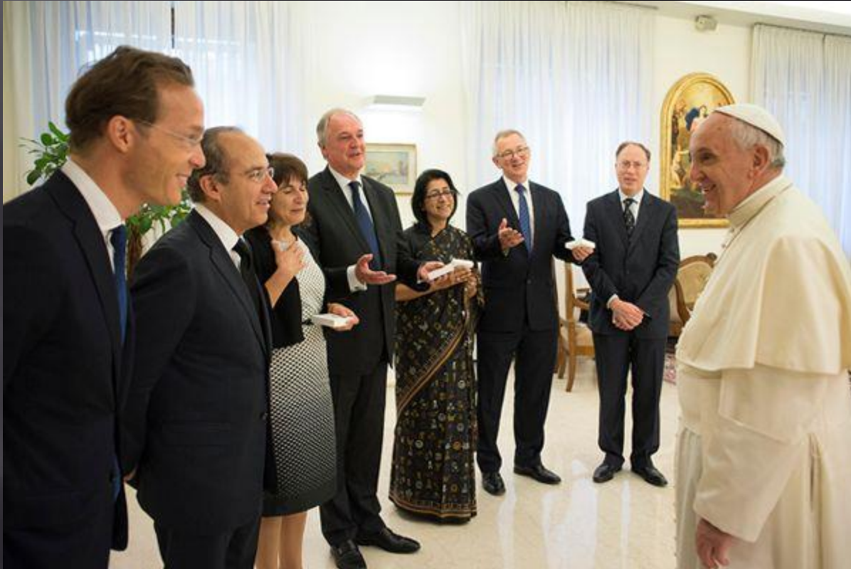
Various Business Leaders