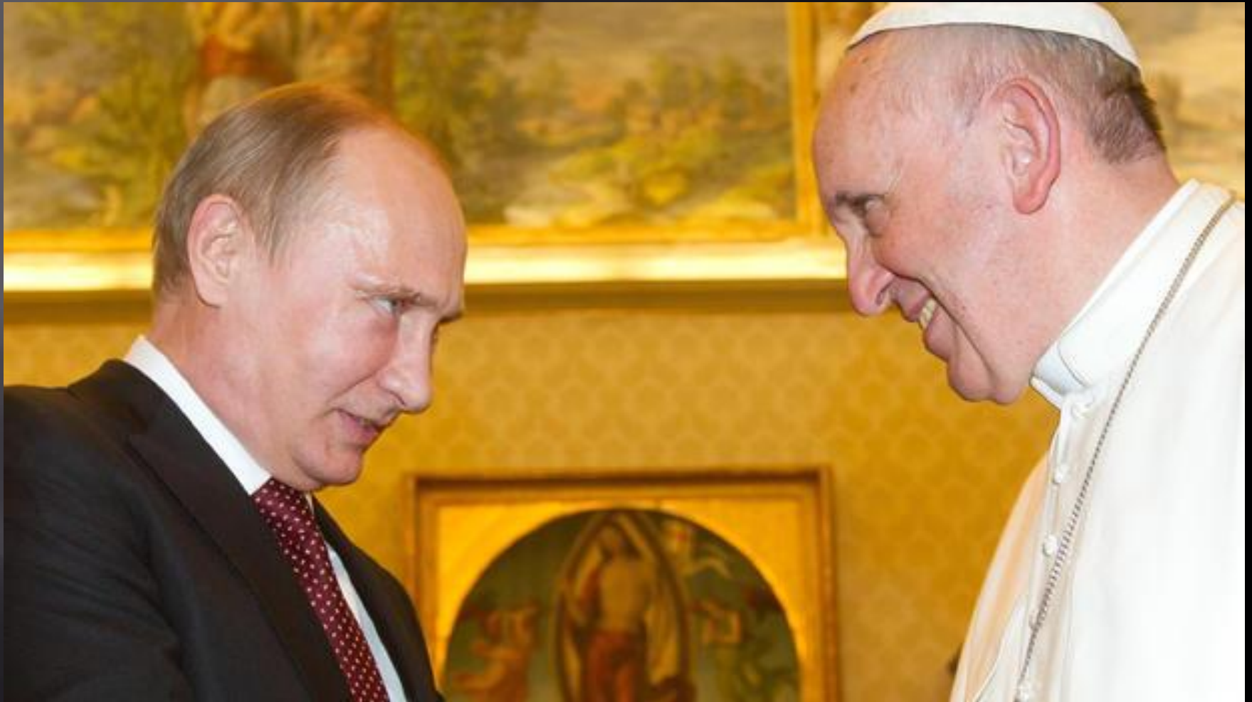
Russia – President Vladimir Putin