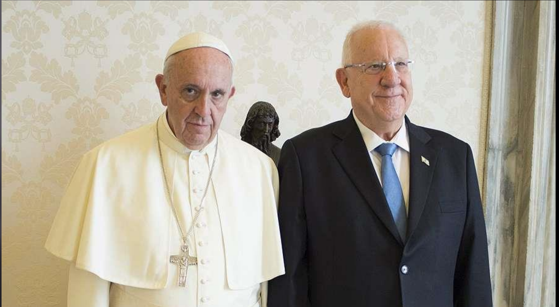
Israel – President Reuven Rivlin