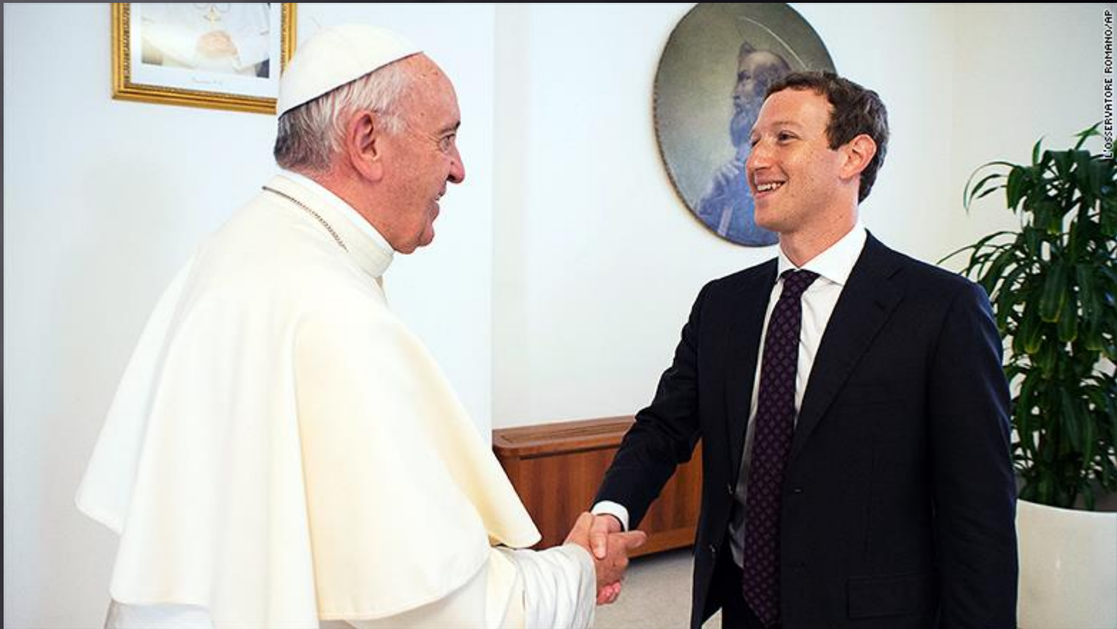
FaceBook – Mark Zuckerberg