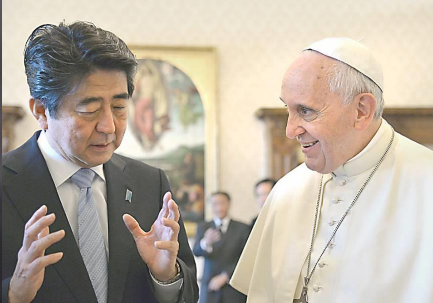
Japan – President Shinzo Abe