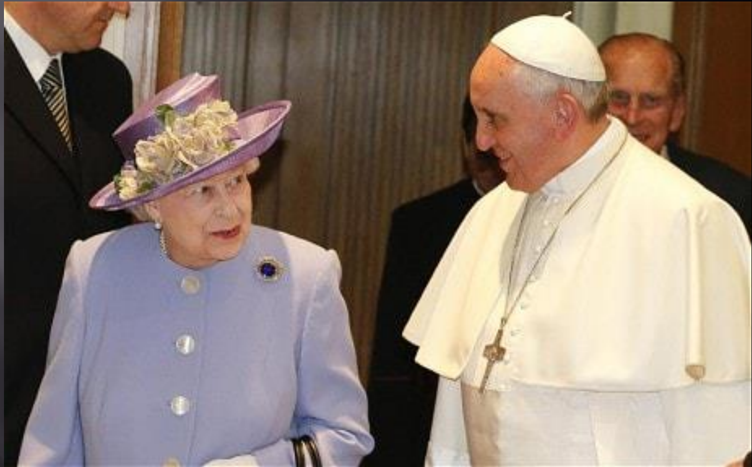
England - Queen Elizabeth