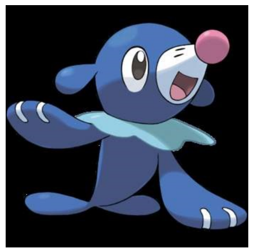
-!Spoiler Warning: Don't read unless you want it spoiled!—