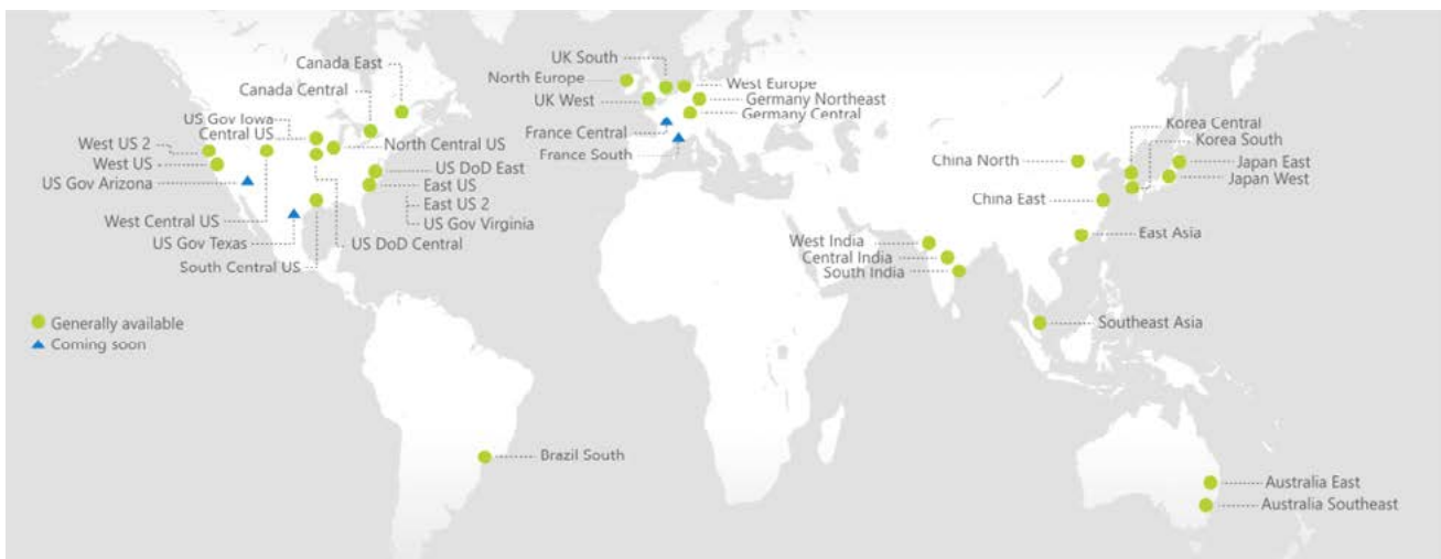
Figure 1 - Azure worldwide cloud regions

coming soon) around the globe (see Figure 1 below). Review and understand how regions use geo-replication to maintain availability and support Azure with its guaranteed 99.9% uptime . It is important to note that not all services are available in all regions.