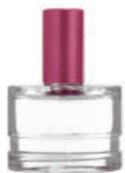
Eau de Toilette Fragrance $25