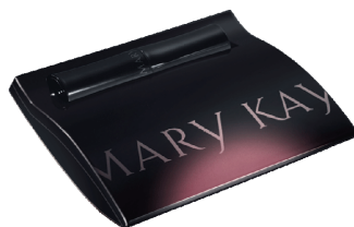
Compact (unfilled) $18