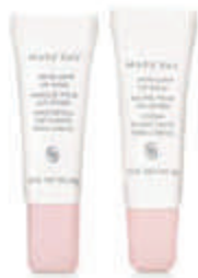
Satin Lips® Set $18