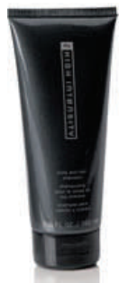
Body & Hair Shampoo $18