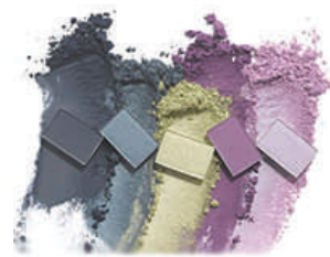
Mineral Eye Color $6.50