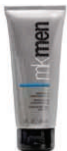
MKMen Moisturizer $22