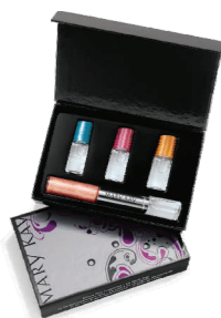
Simply Chic Fragrance/Lip Gloss $22