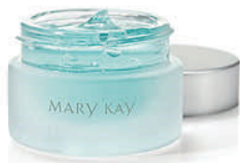
Indulge® Soothing Eye Gel $15