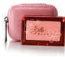
Fragrance Solid $26