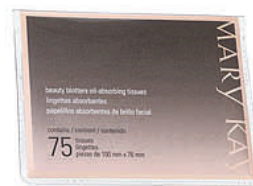
Beauty Blotters $5