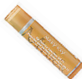
Lip Protector w/ Sunscreen $7.50