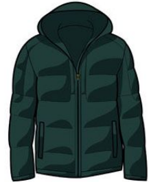
INSULATED DOWN COAT