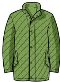
THE QUILTED JACKET