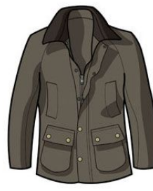
WAXED COTTON JACKET