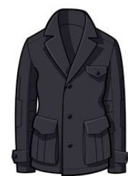
WOOL CAR JACKET