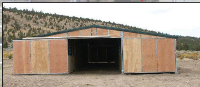
10 STALL TRAINER SERIES BARN with PADDOCK DOORS and BREEZEWAY DOOR

The "Trainer Series" barn is built 36' wide and may be ordered in any length in 12' increments. Stalls are 12' x 12' with a 12' wide covered center aisle. This affordable barn can be expanded at any time. Perfect for your ever-changing equine program.