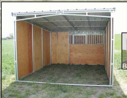
SOLID SIDE/BACK with OPEN FRONT and BACK FEED ROOM

Back feed room has entrance door in back wall. A feed door is set in the grilled section between horse and feed area.