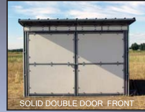
SOLID DOUBLE DOOR FRONT

We use a heavy 15 Gauge Round Galvanized Steel Tube to manufacture our shelters. Both the 1-7/8" diameter and the 1-5/8" diameter material we fabricate with is milled for us to our specifications, and is made right here in the USA. We chose this material for its finish, superior strength and longevity. Like all Noble products, our shelters have a galvanized finish for unequaled rust protection .