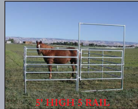
5' HIGH 5 RAIL

Used in Roping Arenas, Round Pens and Paddock/Runs.