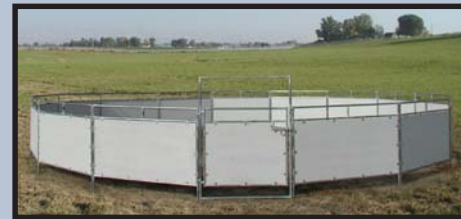
COW CUTTER ROUND PEN

Noble Round Pens are assembled using 12' long Panels and a 6' wide Bowgate.