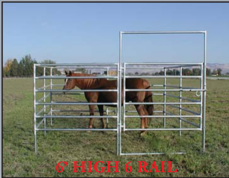
6' HIGH 6 RAIL

Excellent Round Pen panel. Perfect for stallion paddocks.