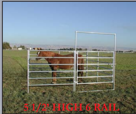
5 1/2' HIGH 6 RAIL

Excellent cattle-working panel. Ideal for Mare/Foal enclosures.