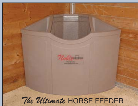
The Ultimate HORSE FEEDER

CLEANER STALLS LESS FOOD IS WASTED MOLDED POLYURETHANE SIDE PANS FOR SALT, GRAIN, SUPPLEMENTS