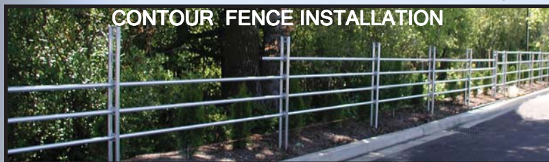
CONTOUR FENCE INSTALLATION

Noble Contour Fencing can be expanded any time . . . . . using either Noble Panels or more Noble Contour Fencing.