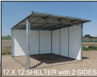
12 X 12 SHELTER with 2 SIDES

Noble SHELTERS with solid walls are fabricated to accept 3/4" plywood of any grade (which is not included). A unique plywood mounting tab is used to secure each piece of wood in place. The plywood is cut to size (as per cut diagram) and is mounted against these mounting tabs with a T-Nut and Machine Screw supplied in each installation kit. This design allows each sheet of wood to be recessed inside the wall panel. There are no exposed edges or corners of wood for livestock to chew or crib on. When installed, each piece of wood will have a small air gap around its perimeter (approximately 1/8" to 1/4"). These perimeter openings offer solutions to commonly asked questions regarding lighting and ventilation . First, animals are more likely to enter a shelter when there is some visible lighting, ie. not a dark hole or box. Second, health issues arise when livestock are contained in poorly ventilated areas. Body heat and moisture can create health problems for different animals where there is little ventilation.