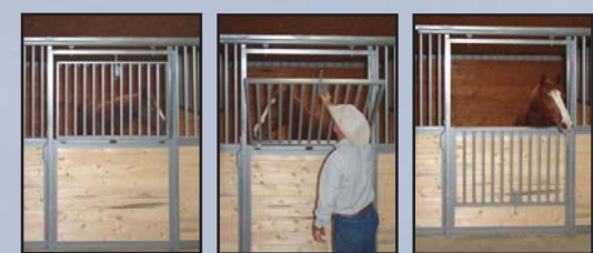
DROP DOWN GRILL OPTION

The Noble SQUARE TUBE STALL FRONTS/DIVIDERS are custom built to your specifications using only the finest material available. They are exceptionally strong and virtually rust-free. The framework is built with 2" X 2" square Galvanized Steel Tube and is fully welded at each joint. The grills are constructed of 1-3/8" round Galvanized Steel Tube and are spaced on 4" centers (leaves 2-5/8" between bars). The wood insert mounts are formed with a heavy 12 Gauge Galvanized Flat Steel. These inserts are available one of two ways: a single flange for flat plywood inserts, or a double flange (channel) that accepts the timeless beauty of 2 x 6 Tongue and Groove lumber (wood not included). Both leave no exposed wood edges for a horse to chew on. Customer supplies all wood products.