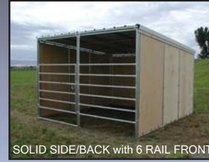
SOLID SIDE/BACK with 6 RAIL FRONT