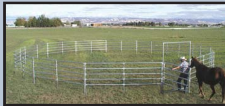
50' 5 RAIL ROUND PEN (5' HIGH)