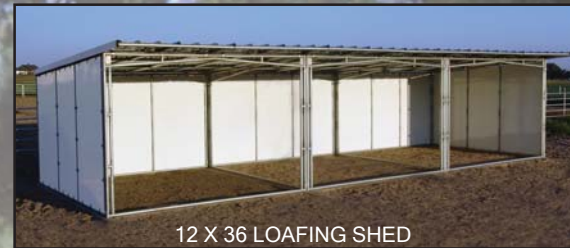
12 X 36 LOAFING SHED

Noble SHELTERS are quick and easy to erect . They come with a set of easy to read instructions and all hardware needed to assemble (wood and roof material supplied by customer). For our solid wall shelters we even include a set of plywood cut diagrams and our recommendations for roof material. Shelter walls are assembled with our proven clamp system, only requiring a 9/16" wrench. Our shelters may be anchored with either a drive-in wedge anchor or anchor post. We offer both systems to anchor your shelter.