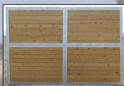
SOLID DIVIDER with TONGUE & GROOVE