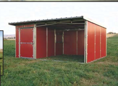
SOLID SIDE/BACK with OPEN FRONT and SIDE FEED ROOM

Side feed room has a door in the back and front. An optional feed door may be added allowing you to feed through the divide wall (as shown).