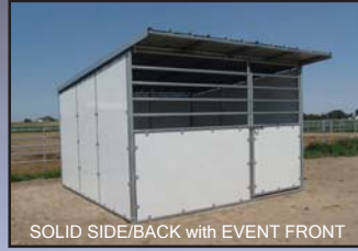
SOLID SIDE/BACK with EVENT FRONT