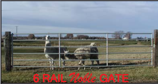
6 RAIL Noble GATE