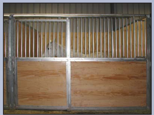
Noble SQUARE TUBE STALL FRONT with PLYWOOD INSERTS

The Noble SQUARE TUBE STALL FRONTS/DIVIDERS are custom built to your specifications using only the finest material available. They are exceptionally strong and virtually rust-free. The framework is built with 2" X 2" square Galvanized Steel Tube and is fully welded at each joint. The grills are constructed of 1-3/8" round Galvanized Steel Tube and are spaced on 4" centers (leaves 2-5/8" between bars). The wood insert mounts are formed with a heavy 12 Gauge Galvanized Flat Steel. These inserts are available one of two ways: a single flange for flat plywood inserts, or a double flange (channel) that accepts the timeless beauty of 2 x 6 Tongue and Groove lumber (wood not included). Both leave no exposed wood edges for a horse to chew on. Customer supplies all wood products.