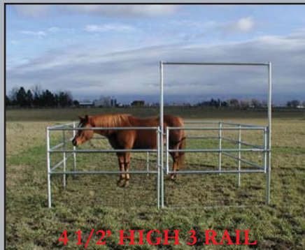
4 1/2' HIGH 3 RAIL