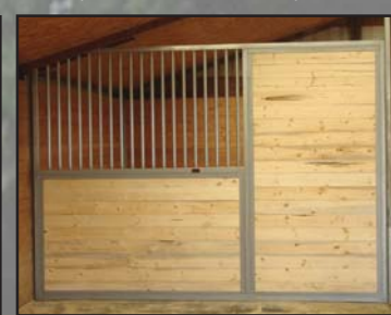
2/3 GRILLED, 1/3 SOLID DIVIDER