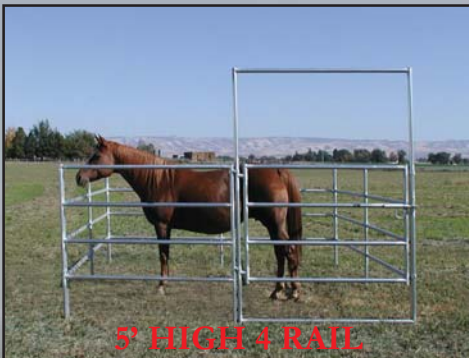
5' HIGH 4 RAIL

For Pleasure Arenas or large fenced pastures.