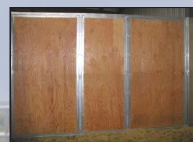
SOLID DIVIDER with PLYWOOD

Noble SQUARE TUBE STALL DIVIDERS are custom built to your specifications. Dividers are available for either Plywood inserts or 2 x 6 Tongue & Groove inserts (wood not included).