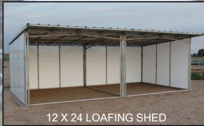
12 X 24 LOAFING SHED

Feed rooms or additional shelters may be added at any time.