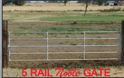
5 RAIL Noble GATE