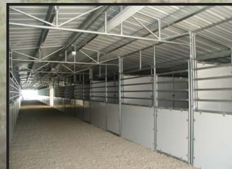
TRAINER BARN AISLEWAY with EVENT FRONTS