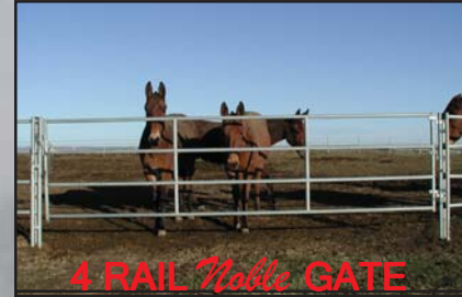
4 RAIL Noble GATE