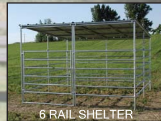
6 RAIL SHELTER

Noble SHELTERS are expandable . With our modular design, you may attach an additional shelter to existing ones or you can change the design or layout of a previously erected shelter. ANY wall can be made to be solid (wood ready), railed (5 or 6 rail panel/gate), or full open for walk-through.