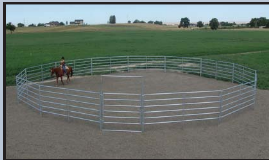
50' 6 RAIL ROUND PEN (5 1/2' HIGH)