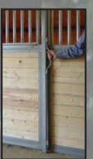
SLIDING DOOR LATCH

All Fronts and Dividers are offered in any length up to 16'.