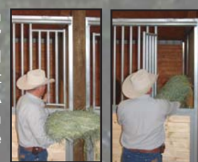
FEED DOOR OPTION

Square Tube Stall Fronts are available with either a Swing Door or a Sliding Door. Each offers a full 52" wide door opening. The sliding door can be ordered with permanent grills or with a Drop Down Grill that will allow a horse to have its head out into the alley. A Yoke Style door can also be ordered. We even offer a Swing-Out Feed Door that allows you to feed from the aisleway.