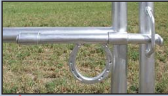
Noble Horseshoe Latch