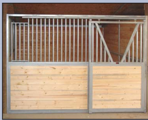
Noble SQUARE TUBE STALL FRONT with 2 X 6 TONGUE & GROOVE INSERTS and YOKE STYLE DOOR