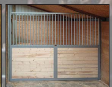
FULL WIDTH GRILLED DIVIDER