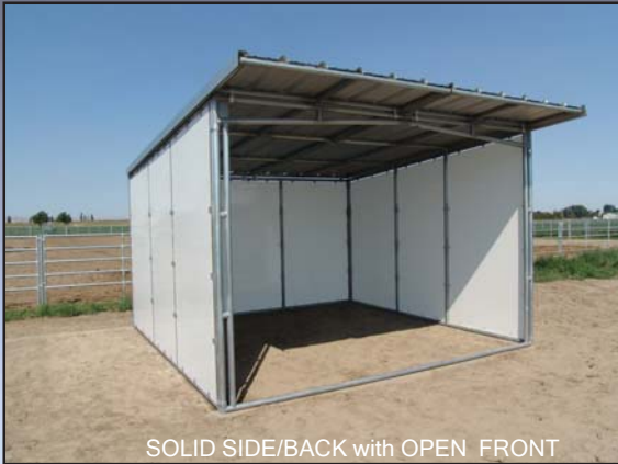
SOLID SIDE/BACK with OPEN FRONT

Noble SHELTERS are designed and built to protect your animals during all four seasons of the year . They provide a warm dry shelter through the fall and winter and a cool shaded retreat during the spring and summer months.