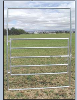
6' WIDE 5 RAIL BOWGATE

8', 10' and 12' Bowgates have heavy double bow frame.