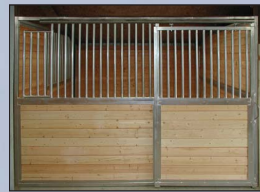
Noble SQUARE TUBE STALL FRONT with 2 X 6 TONGUE & GROOVE INSERTS

Noble Stalls are designed and built with the safety and comfort of your horse in mind. They are as attractive as they are functional--and they are easy to install. Whether you choose the affordable Noble EVENT STALL system or the classic Noble SQUARE TUBE STALL system, you will find that our attention to detail is second to none.