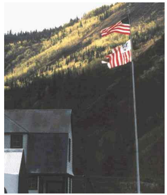
US Civil Flag at the Eagle, Alaska custom-house, on the Yukon River at the Canadian border, circa 1997