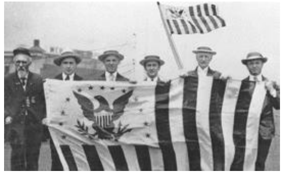
The Flag of Peace US Civil Flags in 1919 at the end of World War I

Such has been the path that has brought us under the Law of the Military Flag. This should have raised serious questions from many citizens long ago, but we've been educated to listen and believe what we are told, not to ask questions, or think for ourselves and search for the truth.